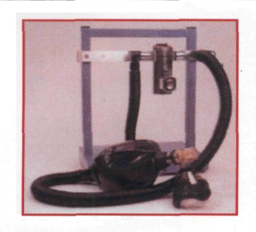
Anaesthesia Machine MP-1 This model is designed for use with a "Draw-over" patient system. By using a resuscitator, ambient air is drawn through the vaporizer and to the patient. It also is possible to use oxygen from an oxygen concentrator.