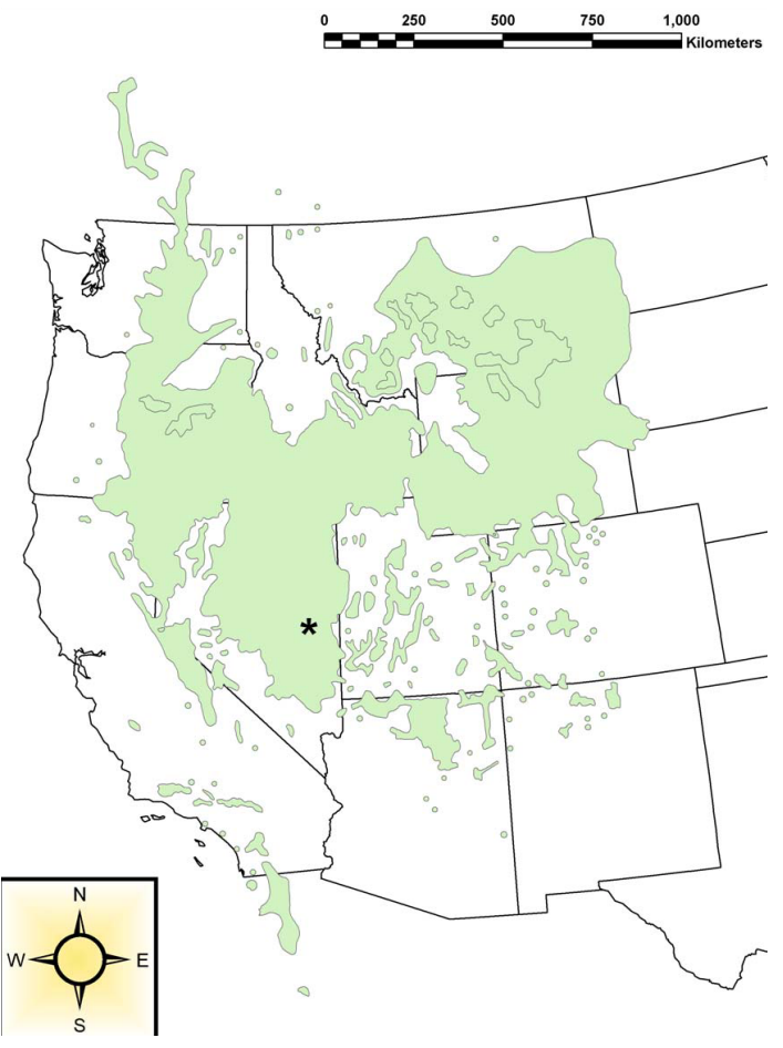
Figure 1 Distribution of big sagebrush (Artemisia tridentata Nutt.) in North America, with location of the study area (asterisk).

erator mass spectrometry (AMS) <sup>14</sup>C analysis was employed to test the annual nature of xylem layers in subtropical trees that could not be crossdated (Biondi and Fessenden 1999), or to verify growth years assigned using stable isotopic values in tropical species (Poussart et al. 2004). In general, when tree growth increments have unclear boundaries but vary in size from one year to the next, accurate dating can only be obtained by combining <sup>14</sup>C dating with macro- and microscopic descriptions of the wood and its layers (Worbes and Junk 1989; Dezzeo et al. 2003). In this paper, we used a combination of dendrochronological crossdating and <sup>14</sup>C AMS analysis to answer the question, "Are growth rings of Artemisia tridentata truly annual?" The answer to this question has immediate implications for the broader issue of reconstructing environmental changes in semi-arid shrublands.