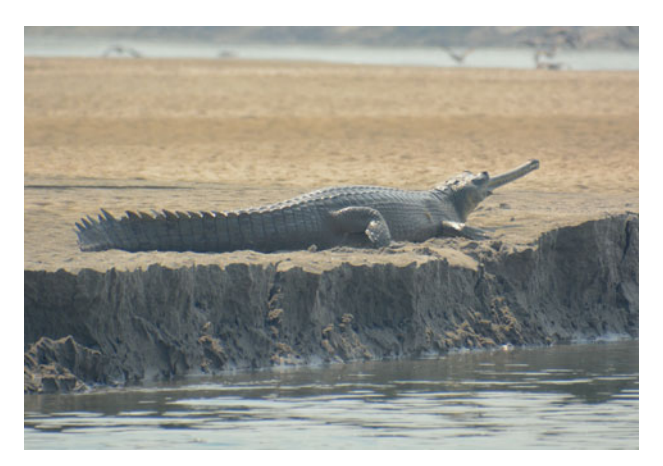
PLATE 1 A basking female gharial Gavialis gangeticus on the Ghaghara River bank, with a bulging abdomen suggesting she could be pregnant.

The Ghaghara River contains long stretches of undisturbed, free-flowing water (Basu & Singh, 2009). Although the river discharge volumes are regulated by the two upstream barrages, the surveyed stretches are free-flowing, with abundant sand available on both riverbanks. The Ghaghara River is a sink for aquatic animals dispersing from the upstream Girwa–Kaudiyala Rivers and contains significant populations of gharials, the Endangered Ganges river dolphin Platanista gangetica , turtles ( Lissemys punctata , Nilssonia gangetica and Pangshura tentoria ) and avifauna (Basu & Singh, 2009; Behera et al., 2014; Singh et al., 2021). Gharial nesting habitat in the upstream Girwa River is degraded because of vegetational succession after a channel