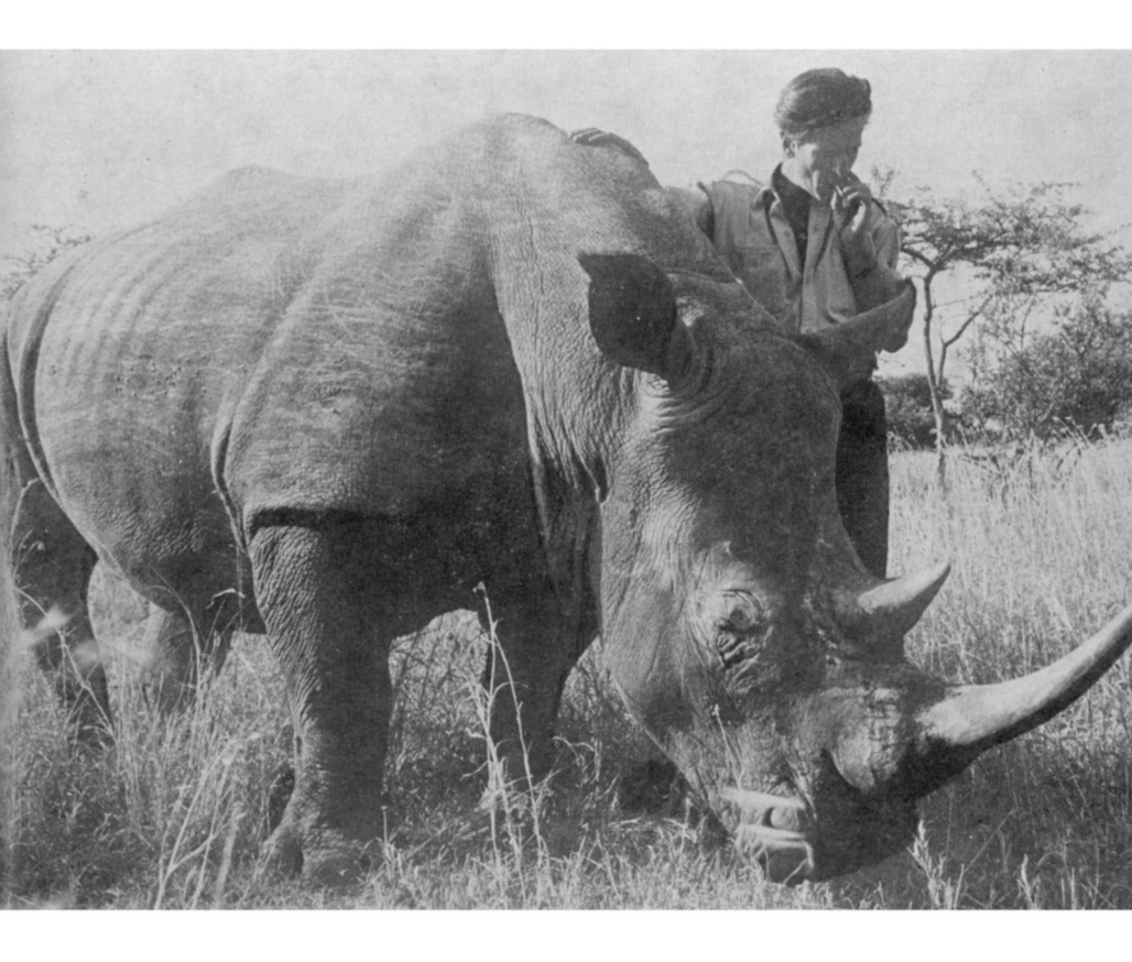
Plate 3: A bull rhinoceros waits patiently. In this state, a rhinoceros will readily enter a crate.