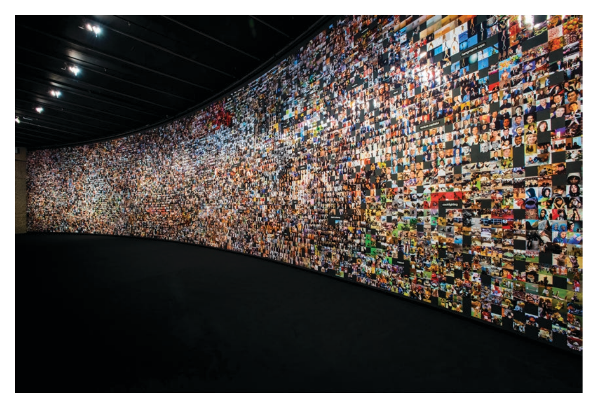
Figure 2. Trevor Paglen, From "Apple" to "Anomaly," installation view, Barbican Art Gallery, 2019