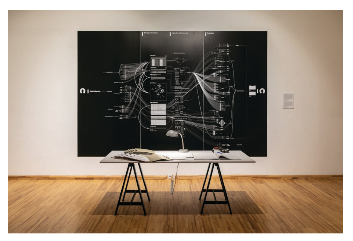
Figure 6. Vladan Joler, Facebook Algorithmic Factory, NOVI EKSTRAKTIVIZAM: o mašinama, eksploataciji ljudi i prirode, MSUV, Fotografija.