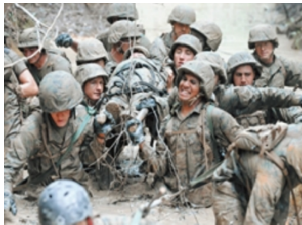
Marines training in JWTC (Jungle Warfare Training Center), known formerly as Northern Training Area, simulate rescuing an injured soldier.