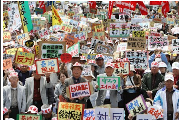
At Tokunoshima Island, Hatoyama’s main option for an “outside Okinawa Prefecture” alternative for Futenma relocation, a mass opposition rally of 15,000 people (out of a population of 26,000), took place on April 18, 2010 (Photo by Jiji News. See Link for details.)

Hatoyama: Our counterpart should have been the US, not Okinawa. I should have gone there first. I should have been more assertive, presenting my plan as the only possible plan. Mr. Obama himself was probably surrounded by voices that told him the only option was to hew to the status quo (the existing US/Japan agreement). Both Japan and the US lacked political leadership on this issue.