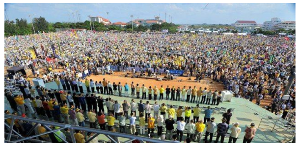
On April 25, 2010, nine days before Hatoyama’s betrayal became official, 93,000 Okinawans gathered to protest base construction at Henoko.

(bureaucrats) explained that the US would strongly oppose the idea, and it did not materialize.” 41 In these statements Hatoyama showed himself impotent in the face of both the bureaucracy and the US.