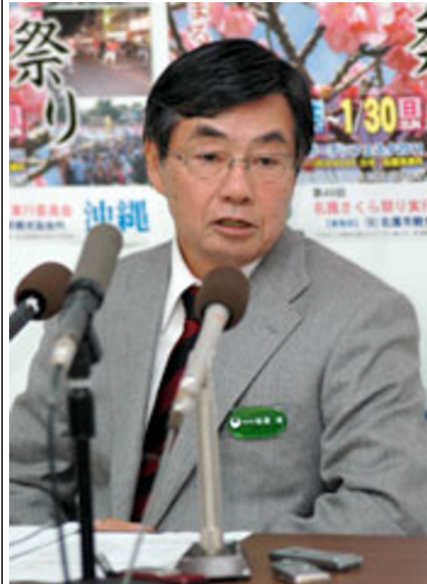
Nago Mayor Inamine Susumu.

(Inamine Susumu, elected Mayor of Nago in January 2010)