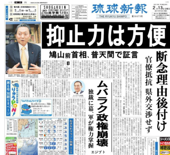
Ryukyu Shimpo on February 13, 2011. The headline reads “Deterrence was [just] a Pretext”

While most Japanese newspapers led with the resignation of Egyptian President Hosni Mubarak on the morning of February 13, it was different in Okinawa. Both Okinawan dailies, Ryukyu Shimpo and Okinawa Taimusu , ran as their top story, “Deterrence was [just] a Pretext,” ( Yokushiryoku wa hoben ). 1 In a joint interview held in Tokyo on January 31 and February 8 with the two Okinawan papers and the Kyodo News Agency, former Prime Minister Hatoyama Yukio conceded that he had just given “deterrence” as the factor necessitating retention of the US Marine Corps on Okinawa (and hence the building of a new Okinawa base for them) because he needed a pretext. Nine months after stepping down as Prime Minister, he conceded that this was not true. Since then, Hatoyama has scarcely stopped talking, even giving an interview to a Hong Kong TV station, 2 and in the process he has shed vivid light on Japanese policymaking and the US-Japan-Okinawa relationship. Japan scarcely needs a Wikileaks when it has a Hatoyama.