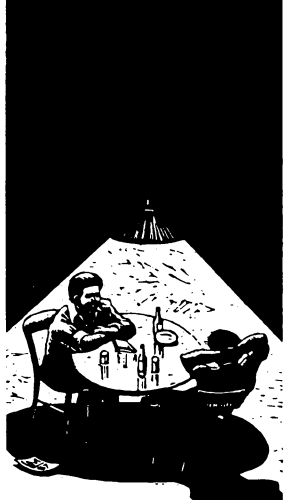
Illustration from MEMOIRS OF A MEXICAN POLITICIAN