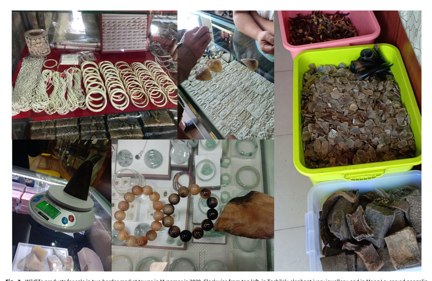
Fig. 2. Wildlife products for sale in two border market towns in Myanmar in 2020. Clockwise from top left, in Tachilek: elephant ivory jewellery; and in Mong La: carved pangolin scales on top of a display cabinet with elephant ivory pendants; boxes with (1) muntjac antlers, (2) pangolin scales and serow horns and (3) dried elephant skin; rhino horn bead bracelets and a piece of raw rhino horn (bottom right); rhino horn tip on a scale.

residents are Chinese. Mandarin/Putonghua is spoken widely in Mong La, signs are in Chinese characters and the mobile phone network and electricity providers are Chinese. The Chinese