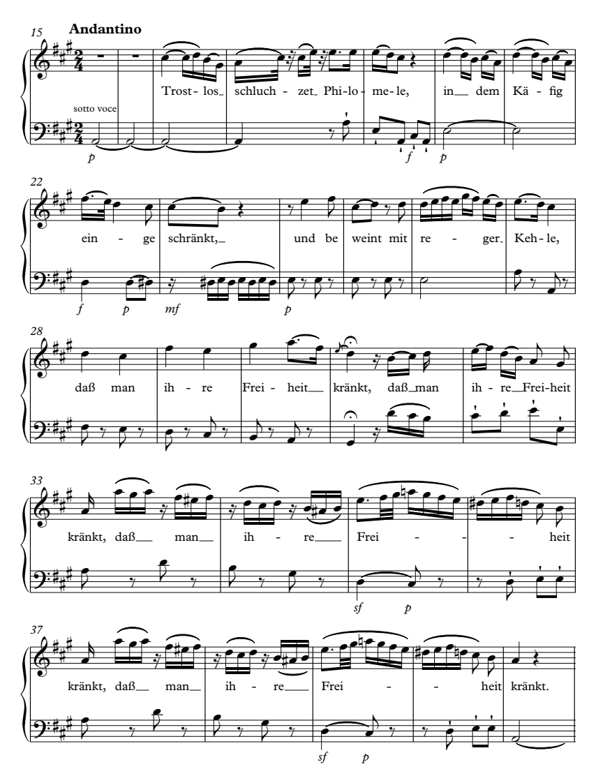
Example 1 W. A. Mozart, 'Trostlos schluchzet Philomele', from Zaide (Das Serail) , bars 17–41, vocal and bass line only ( Neue Mozart-Ausgabe , series 2/5, volume 10, ed. Friedrich-Heinrich Neumann (Kassel: Bärenreiter, 1957)). Used by permission

As Blake's poem unmistakably illustrates, birds and cages were also poignant symbols of sexual availability, pursuit and conquest. They appear frequently in galant painting, most famously François Boucher's Les oiseleurs (The Bird-Catchers, 1748) and Jean-Baptiste Greuze's many gauzy portraits of young girls and their (often dead) birds.<sup>6</sup> Song, as it had done for centuries, served as both mood music for the act of seduction, and the inevitable lament that followed an act of deflowering. It could even be employed to manipulate actual birdsong, as we find in the serinette , a small barrel-organ designed to coax vocalizations from pet