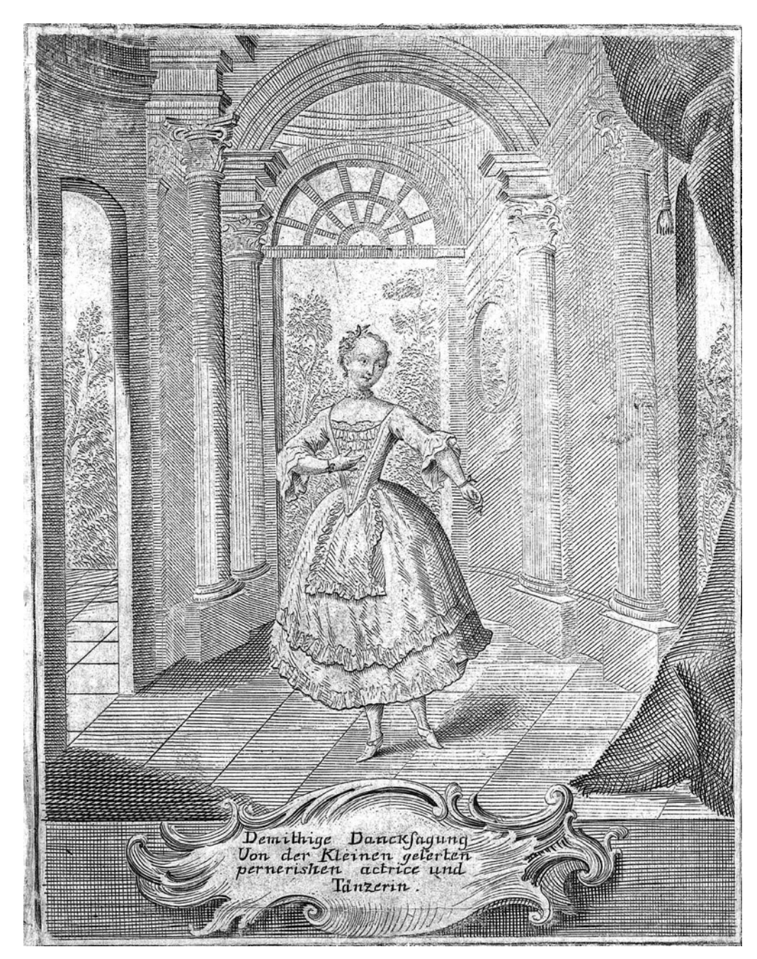
Figure 3 llustration accompanying the farewell address by an unnamed actress in the Berner Company (Margaretha Liskin?), from a souvenir brochure published in Salzburg in 1783.