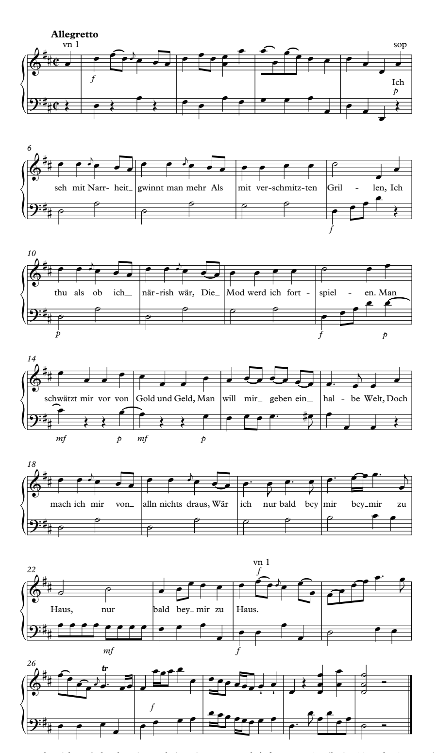
Example 2 Joseph Friebert, 'Ich seh, mit Narrheit gwinnt man mehr', from Das Serail, eine Teutsche Operette (Passau, 1779), voice, first violin and bass lines only. Copyright Don Juan Archiv, Vienna. Used by permission