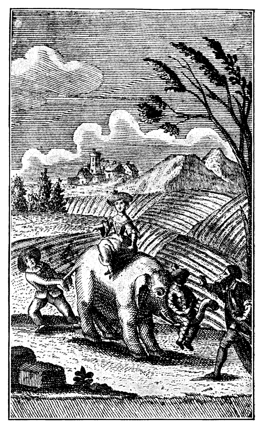
Figure 1 Detail from engraving in Franz Xaver Garnier, Nachricht von der Bernerischen jungen Schauspieler Gesellschaft, von der Aufnahme und dem Zuwachse derselben ... (Bayreuth[?], 1782); reproduced in Gertraude Dieke, Die Blütezeit des Kindertheaters: Ein Beitrag zur Theatergeschichte des 18. und beginnenden 19. Jahrhunderts (Emsdetten: Lechte, 1934). Bodleian Library, Oxford. Used by permission