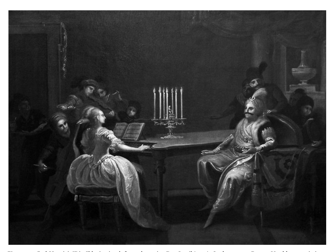
Figure 4 Carl Henrici, 'Die Sklavin singt', from the series Das Serail (1780). Stadtmuseum Bozen. Used by permission

Das Serail, created in 1780 by the Bolzano-based painter Carl Henrici, and loosely based on the Berner troupe's Das Serail.<sup>75</sup> The second painting, known as 'Die Sklavin singt', appears to depict the singspiel's audition-scene tableau rather than the private reflection of 'Ich seh', mit Narrheit' (see Figure 4). But this makes its placement of singer and spectator especially significant: both figures are equally worthy of the viewer's gaze. If anything, the bodily orientations of the accompanying ensemble direct the eye to the forward-facing sultan, who appears almost as though he could be performing to the slave-girl's accompaniment.