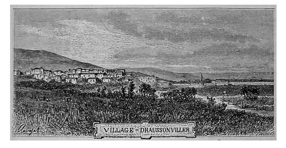
Figure 2. Drawing of Azib-Zamoun/Haussonvillier.

and blurred enough so as not to overshadow the village to its left, and yet sufficiently present to remind the viewer of events preceding the construction of the village, adding a subtle dimension of triumphalism to an overall impression of idyll.