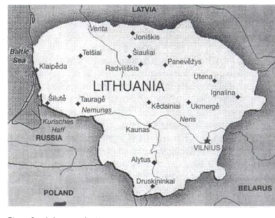
Fig. 1. Map of Lithuania

The gross national product (GNP) is US$310 per capita, almost 19 times less than the GNP of the US and 14 times less than that of the UK. Poor economic prospects, high rates of unemployment, corruption of some bankers, businessmen and government officials, and the disillusionment of large numbers of the population who hoped for democracy without knowing precisely all the implications of an abrupt move from a communist system into a free economy have all produced general despair and public insecurity. In this context, according to the psychiatrists I met in Lithuania, there is an increase in the rate of delusions related to buying and selling and economic activities along with the development of the market economy in Lithuania. Even though official statistics are not yet available, the rate of depression is increasing in an unprecedented manner, along with an increasing rate of unemployment. At the same time, the number of socially neglected patients with