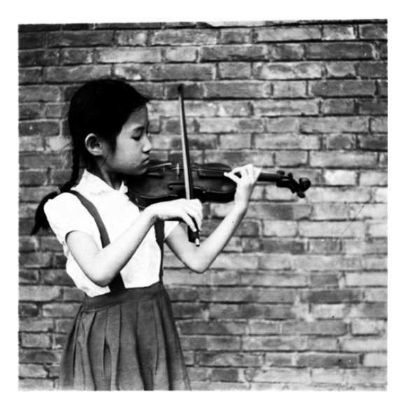
Figure 9 Chen Yi, 1961

work. The combination of these aptitudes with early instrumental instruction, the influence of life-long mentors, and rich learning at home set Chen up for rapid progress and, eventually, specialization.