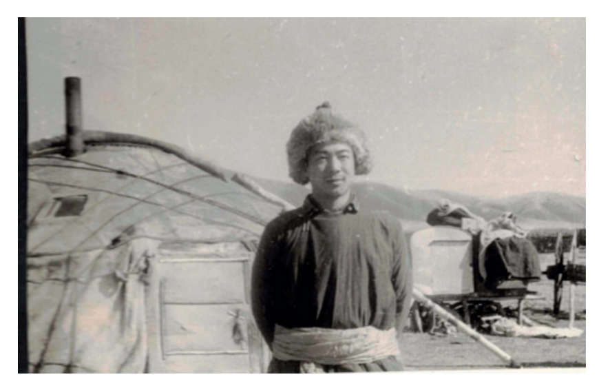
Figure 5 Zhou Long in Mongolia, 1976

sensitized Zhou to the art of notating microtonal inflections in pitch and text. Zhou shared, "As a composer, you have to give very clear directions, because you can't demonstrate to the musicians every time, if you are not there. So, you have to notate it, and we notate it by using some notes or directions . . . For the instrumental and vocal parts, we gave directions on how to mimic the style." Zhou's visit to Inner Mongolia left a strong impression. He recalled learning opera in the Mongolian folk song style and living in a tent with the Mongolian people and observing small children riding horses and singing these folk songs (Figure 5).