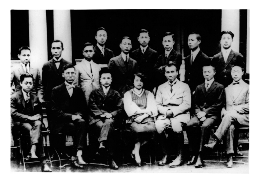
Figure 2 He Zhihua and Zhu De (front row center in light clothing), 1923 in Germany

he was a supporter of the revolutionary movement, he and his descendants were placed on the government's blacklist.