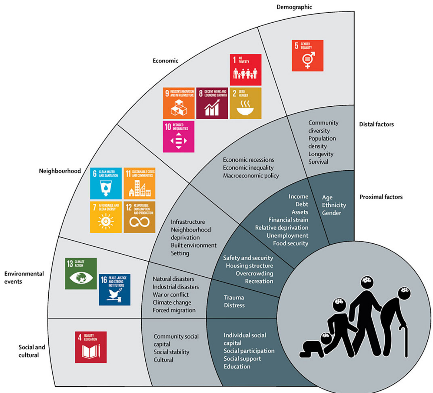
Figure 1. Social determinants of mental disorders and the Sustainable Development Goals: a conceptual framework by Lund et al. (2018).

While Lund’s framework was previously used in a review of national-level interventions, evidence presented was mostly observational and from higher or upper-middle income countries (Shah et al., 2021). Using the same conceptual framework, we aimed to strengthen the evidence base by conducting a systematic review of reviews including Lund et al. (2018) and Rose-Clarke et al. (2020) et al.’s proposed intervention priorities, with evidence