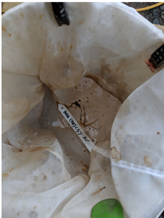
Figure 2. Image of light fraction in a fine mesh sieve bag.

Historically, weed ecological research in archaeobotany (like ecological research in general) could be divided into two approaches: the autecological approach and the synecological approach. Autecology focused on the behavior of individual species. Synecology, also referred to as phytosociology, focused on plant communities as a whole. Using the presence or absence of key diagnostic species known to have narrow ecological ranges, archaeobotanists would be able to interpret entire weed communities to make inferences about the environments in which these communities might have been formed. For a more detailed discussion of the differences between these two approaches, see van der Veen (1992).