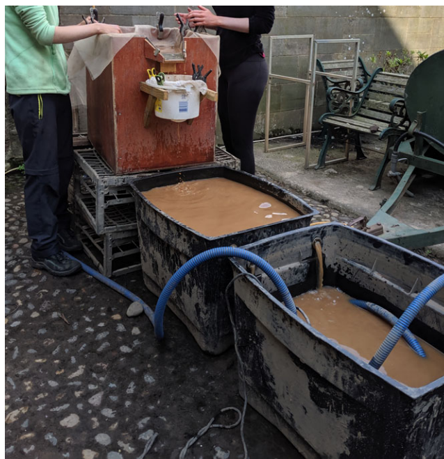
Figure 1. Example of a flotation setup from Bamburgh Research Project, July 2019. The mesh is placed in the wooden tank and water is recirculated through two black settling tanks.

small weed seeds that would be otherwise overlooked. As smaller weed seeds began to be recovered in greater numbers with flotation, archaeobotanists began to study them in greater detail.