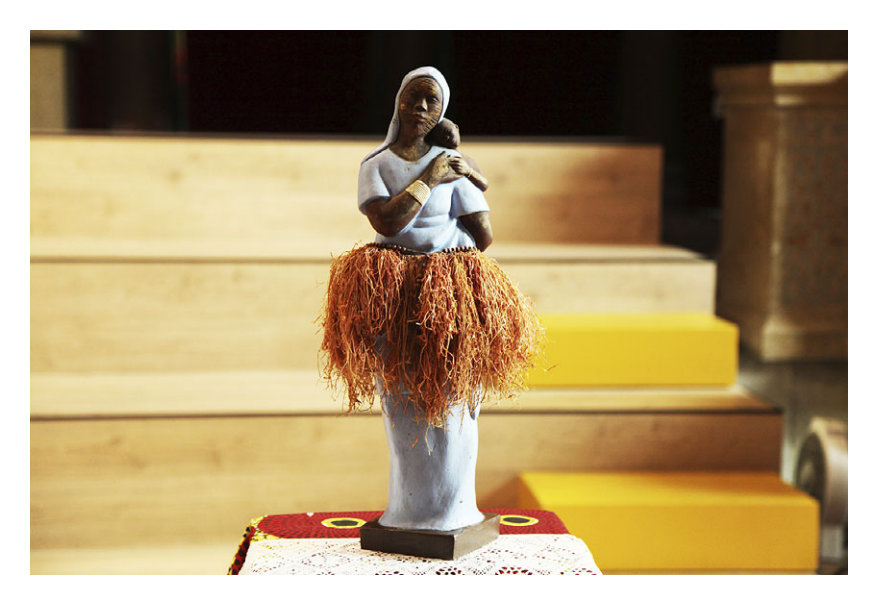
FIGURE 6: Version of the statue of Bisila belonging the the Associació catalano-guineana Verge de Bisila (Barcelona). Roger Canals photo, 2017.

Virgin of Montserrat and representing a creative fusion of the Virgin Mary and the Bubi spirit Bisila. With this icon, a new cult based on religious replacement began, but it incorporated elements of the "traditional" religion of the local Bubi communities. The missionaries tried to liken the Bubi fertility spirit Bisila to the Catholic virgin, and created an image based on the imagery of Western virgins, which up to that point had no material appearance. The image inaugurated the new Bubi cult. The cult recognized the legitimacy of Catholic rites in Equatorial Guinea, because there were many Christians due to the colonial project and because Bisila was the first and only African virgin to be recognized by the Vatican, in 1987. The Bubi cult remains active today.<sup>42</sup>