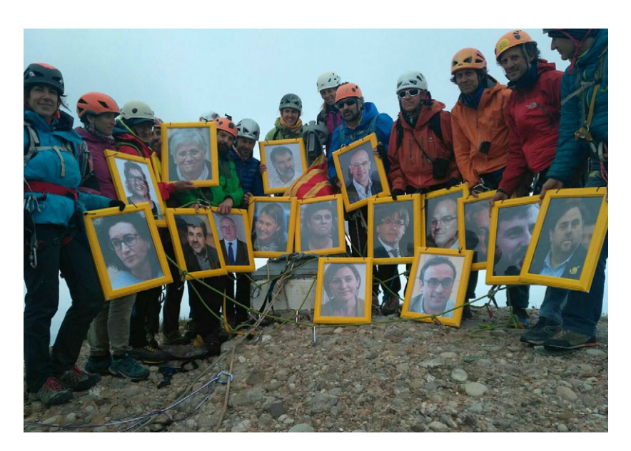
FIGURE 2: Independentist pilgrimage to Montserrat, 2018.

Madonna and Catalonia. It also illustrates how the real political rivalry surrounding this image no longer takes place between the different sectors of Catalan nationalism, as was the case at the end of the twentieth century, but between those in favor of and those against political Catalan nationalism.