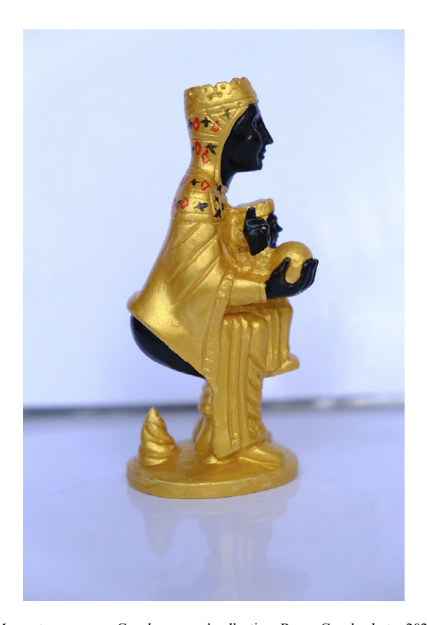
Figure 3: Moreneta caganera. Canals personal collection. Roger Canals photo, 2021.

planned for Catalonia's national day. This date has always been one for holding sovereignty protests, which have been mass protests since the movement's beginning in 2012. Since then, the protests have made the most of the human potential gathered, organizing large performances. In 2013, protesters were called to form a giant 11-kilometer-long V in Barcelona, called "Via Catalana." It could be seen from the sky with the colors of the Catalan flag and was used by anarchist collectives who converted it into a giant A, adding a second protest to the central intersections. They employed an image of the Virgin of Montserrat wearing an anarchist militia hat bearing the motto "Catalunya will always be blacker than the black Madonna" (the color black defines anarchism). This is yet another example of subversion and iconic appropriation, in this case by a third community that does not, theoretically, fall under Catalan or Spanish nationalism.