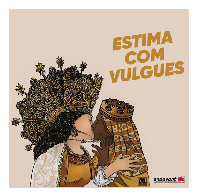
FIGURE 4: Poster from ENDAVANT. Estima com vulgues (Love however you want). Used with maker's permission.

We can add to these examples the countless memes and visual jokes about the black Madonna circulating on the internet.<sup>27</sup> In one, with a notable Spanish nationalist tone, she appears as a Marian figure crushing the urns used in the first independence consultation in 2014. Others show the national police detaining her for being "black" and a Jihadist, because she wears a veil. These volatile and often anonymous memes are related to the long iconoclast tradition we have noted, taking it to extremes and adapting it to new digital formats and language modes. These new images have, recursively, contributed to the icon of La Moreneta's meaning.