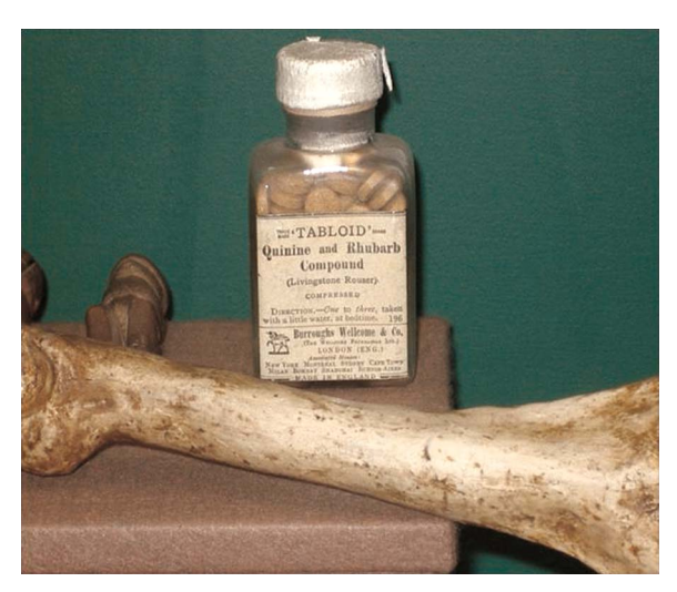
Fig. 2. Livingstone's rousers. The quinine, rhubarb and jalap mixture that Livingstone concocted was later marketed by the Pharmaceutical Company Burroughs Wellcome & Co. This bottle is on display at the David Livingstone Centre in Blantyre. A cast of the bone broken in a lion attack is in the foreground.

edition as the mentor of Sir William Leishman (see article in this special issue by Heather Vincent). Although not the first to use quinine, Livingstone's fame and the reverence in which he was held helped assure systematic use of the drug as Britain extended her colonial rule in the tropics. The drug, still used today, also inspired the production of other drugs, such as chloroquine, a cheap, chemically made quinoline-based alternative. The emergence of resistance to chloroquine has rendered it useless across many parts of the world, but other drugs are available. Many of these are based on a Chinese herbal remedy, artemisinin, of which Livingstone would have approved, given his frequent and diligent experimentation with possible herbal cures for malaria and other diseases. New medicines are also appearing at an impressive rate in efforts led by the Medicines for Malaria Venture (MMV) (Wells et al. 2015), as modern pharmaceutical chemistry is applied to the disease.