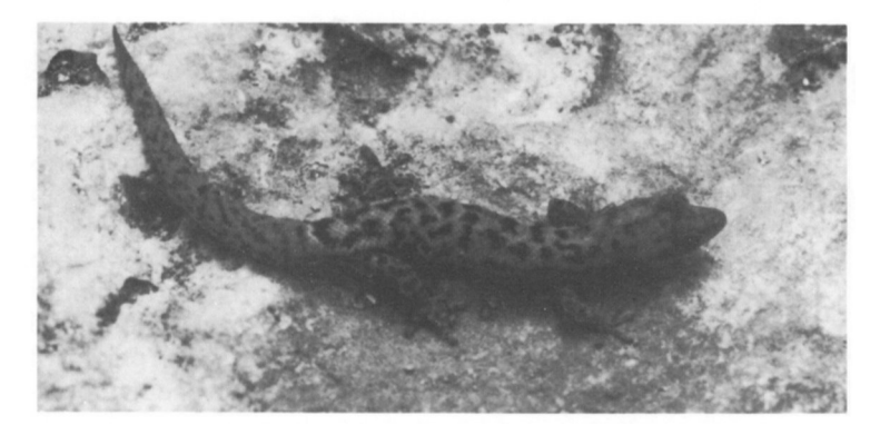
Monito gecko (C. Kenneth Dodd (Jr)).

will be in sight at any given moment. . . . The apparent low numbers of Ameiva and Sphaerodactylus might be the result of rat predation. If the Sphaerodactylus turns out to be an endemic species or subspecies and if its numbers are as low as our data indicate, a rat removal program may be necessary for its preservation.'