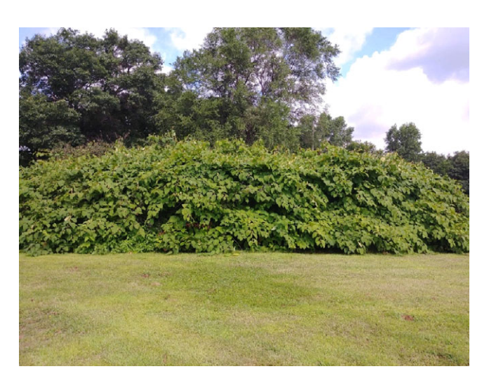
Figure 2. Example of a knotweed monoculture growing in Minnesota. Photograph shows a Fallopia \times bohemica population from Brooklyn Center, MN, on August 16, 2019.

mechanism of knotweeds, as light treatment studies yielded inconclusive results.