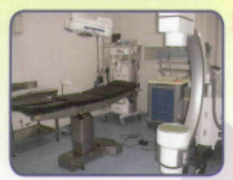
Inside OT in KATIKO Referral Hospital