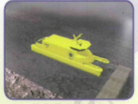
NorCat Floating Hospitals