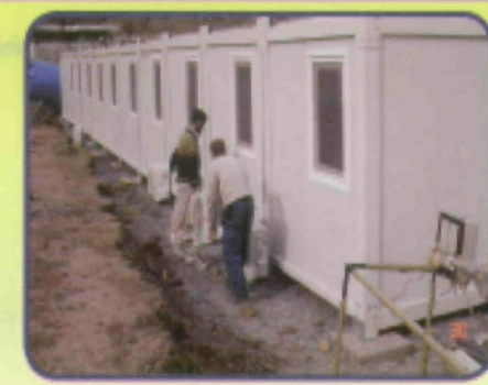
MSF Hospital, Hattian Bala, Pakistan