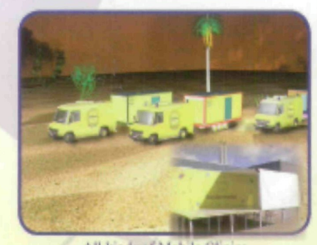
All kinds of Mobile Clinics