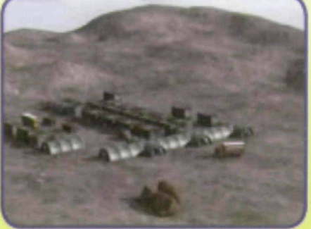
Norlense inflatable tents