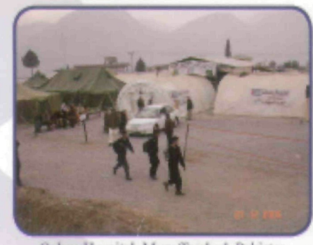
Cuban Hospital, Muzaffarabad, Pakistan