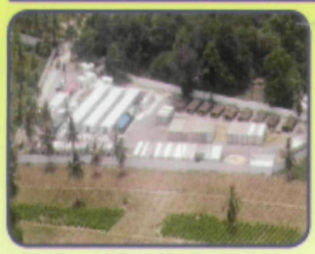
Thai Tsunami Victim Identification Centre