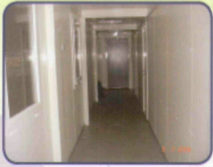
Inside MSF Hospital in Hattian Bala