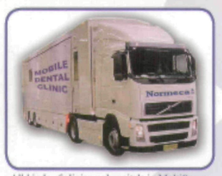
All kinds of clinics or hospitals in MultiSpace