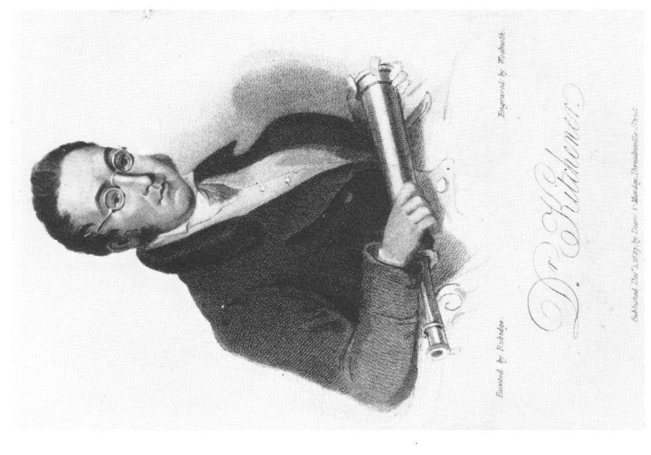
Figure 2. Portrait of Dr William Kitchiner. Stipple engraving by T. Woolnoth, 1827 after J. W. Rubidge, [n.d.]. Wellcome Institute library, London.