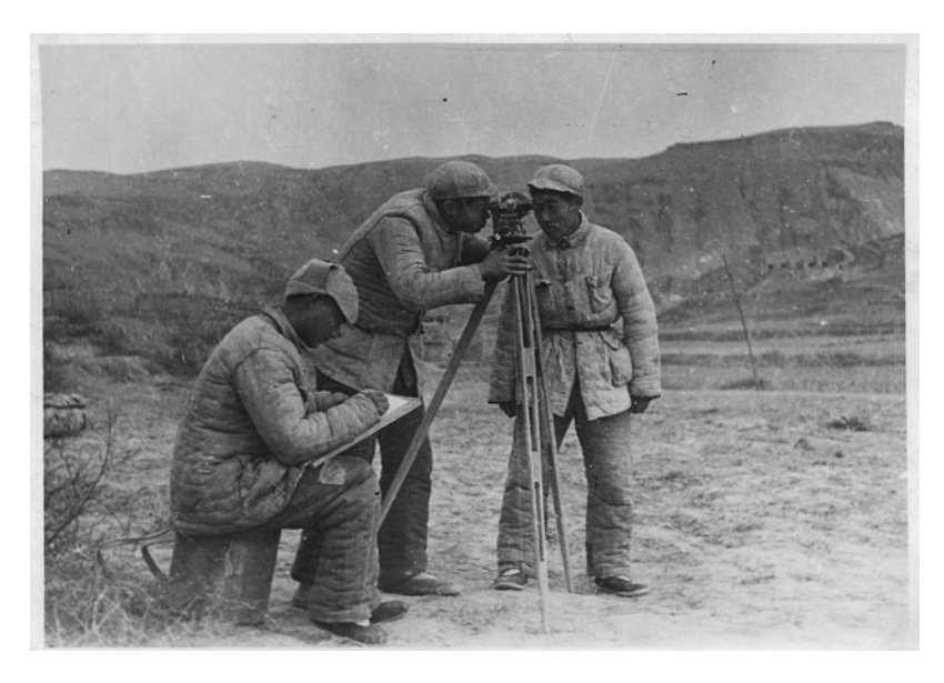
Figure 3. Needham's original caption: 'Shensi Border Area, surveying class'. NR12/10/1/1/8/3/3, reproduced courtesy of the Needham Research Institute.