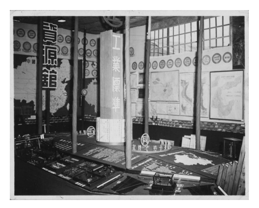
Figure 1. Entrance Hall, Chongqing Industrial and Mining Exhibition. NRI2/10/1/1/8/13/2, reproduced courtesy of the Needham Research Institute.

assertion near the opening of his article that it 'attracted daily many thousands of visitors'. <sup>40</sup> It was a much better match than any of his own photographs, in which only a steady stream of visitors appear.