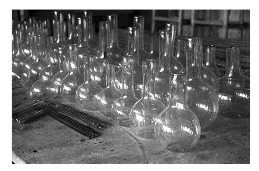
Figure 2. Laboratory glassware. NRI2/10/1/1/8/3/12, reproduced courtesy of the Needham Research Institute.