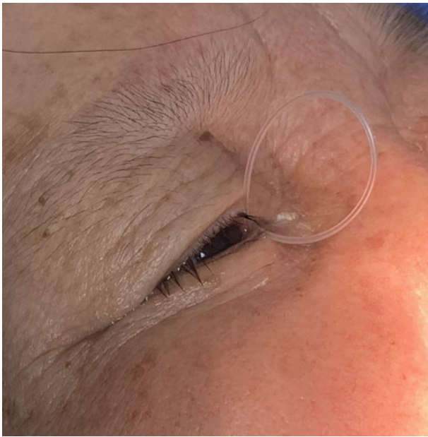
Figure 1. Patient with prolapsed silicone tubes. The silicone tube can be seen slipping out of the medial canthus.

lacrimal duct obstruction, 2 cases of chronic lacrimal duct inflammation, 3 cases of canalicular laceration and 1 case of lacrimal canaliculus laceration.