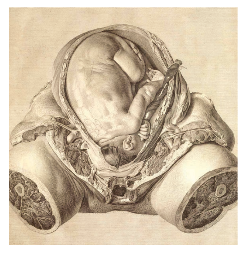
Figure 5. Plate 6 from William Hunter's Anatomy of the Gravid Uterus, likely drawn by Jan Van Rymsdyk, 1774.

These drawings of the women are unsettling. The female anatomical models—drawn from corpse specimens—are depicted as pure objects. In fact, they look like slabs of meat: in order to focus on the torso and the uterus, their heads, arms, and thighs are cut off. Ludmilla Jordanova writes: