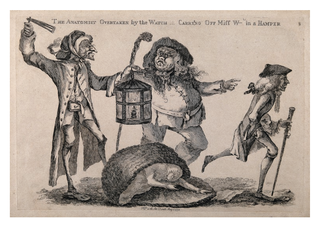
Figure 3. "A nightwatchman disturbs a body-snatcher who has dropped the stolen corpse he had been carrying in a hamper, while the anatomist runs away." Etching with engraving by W. Austin, 1773.

Despite the lack of Protestant or Catholic doctrine on the subject, there was widespread belief that only whole and intact bodies would ascend into heaven on Judgment Day. The only remaining image of the inside of Hunter's Windmill Street Anatomy Museum is a cartoon entitled "The Resurrection or an Internal View of the Museum in W—d-m—ll Street on the Last Day," which is attributed to satirist Thomas Rowlandson. In this engraving, those very real fears about anatomy are played out, albeit in a comic manner.