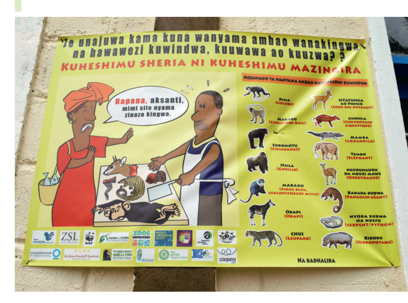
Photo: There is a correlation between the hunting of wildlife and the influx of industries, such as logging, mining and industrial agriculture. The link reflects not only that logging and mining operations open up forests with roads, allowing hunters to penetrate into previously inaccessible forest areas, but also that these industries bring large workforces that require food and thus represent a ready market for wild meat hunters. Illegal wild meat poster to raise awareness, eastern DRC. © Jabruson (www.jabruson. photoshelter.com)

companies in law enforcement efforts to protect apes from being killed (Morgan et al., 2013). FSC Principle 6, for example, states that a certified organization "shall maintain, conserve and/or restore ecosystem services and environmental values of the Management Unit, and shall avoid, repair or mitigate negative environmental impacts" (FSC, 2015, p. 14). Criterion 6.6 under this principle requires that companies demonstrate that effective measures are in place to control hunting. The IUCN's FSC guidance specifically addresses companies that operate in countries that suffer from weak law enforcement capacity, emphasizing that meeting this criterion may require the companies themselves to support or finance