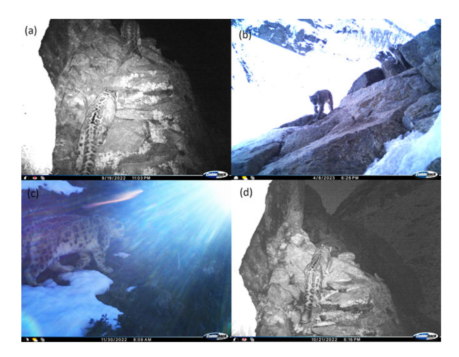
PLATE 1 Camera-trap photographic records of the snow leopard Panthera uncia in Kishtwar High Altitude National Park, Jammu and Kashmir, India; (a) is the first camera-trap record, on 19 September 2022, with two individuals.

During 6,623 trap-nights we obtained photographs of two individual snow leopards in a single frame on 19 September 2022 at 23.03 in the Kiyar catchment of the Dacchan range at 3,280 m. This was the first photographic evidence of the species in Kishtwar High Altitude National