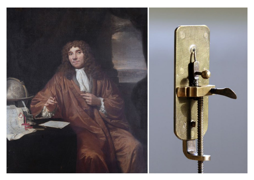
Figure 1. Left: Antonie van Leeuwenhoek (1632–1723), portrait by Jan Verkolje. Right: A replica of Leeuwenhoek's microscope.

consider whether or not any content (words, depictions or imagery) might have the potential to cause offence... [T]he aim of this guidance is to help you to identify and prevent the publication of inappropriate content in our journals and books, and to encourage you to reflect on how inappropriate content can impact members of the community and readers around the world.