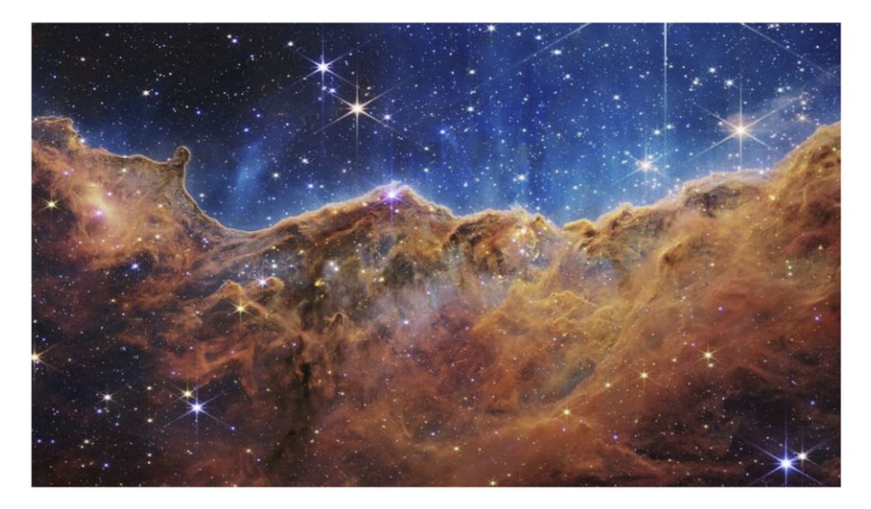
Figure 4. Image of a star-forming region in the Carina Nebula obtained by the James Webb Space Telescope.

A disturbing aspect of this story is how scientific publishers have reacted to the cancellation campaign. Rather than following the example of NASA leadership, which evaluated the validity of the claims of the activists before making a decision, the Royal Astronomical Society responded with the following instructions to authors: The Royal Astronomical Society 'expects authors submitting scientific papers to its journals to use the JWST acronym rather than the full name of the observatory. In this case, the previous requirement for the acronym to be spelled out at first mention will not be observed' (Kahlon 2022).