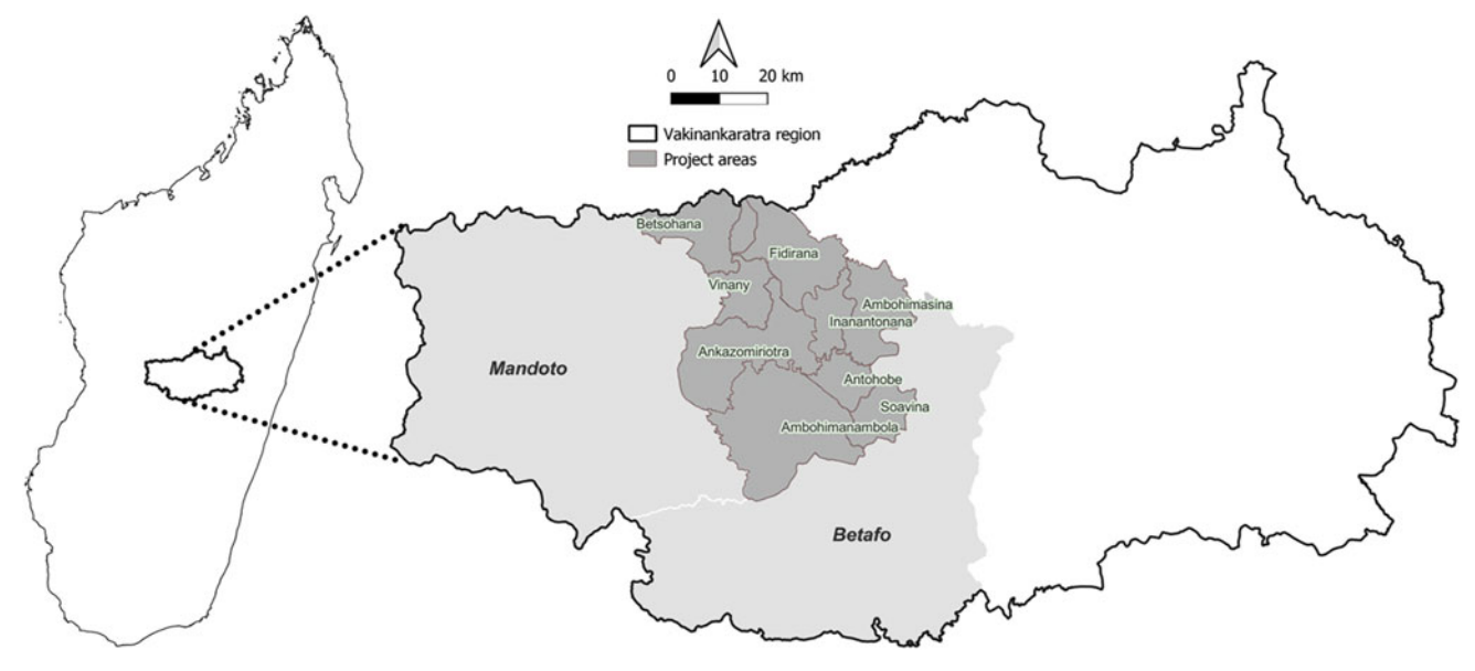
Figure 1. Map showing the location of the project area in central Madagascar.

An animal was determined to be a confirmed case of porcine cysticercosis if 1 or more viable cysticerci were found in the