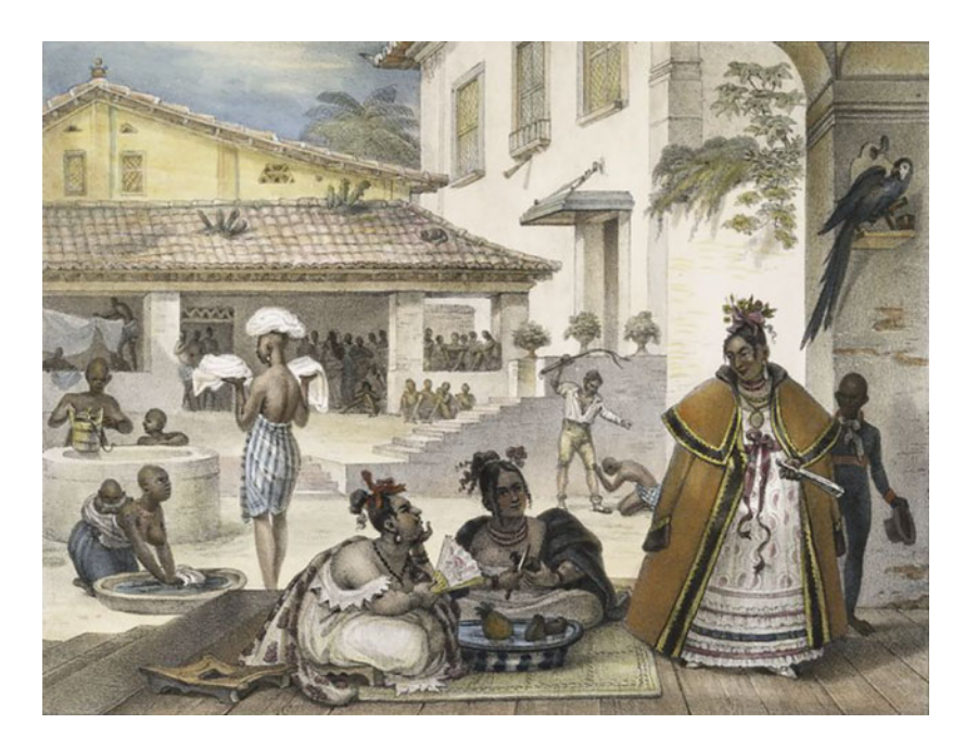
Figure 1. "Plate 24: Intérieur d'une habitation de Ciganos (Bohémiens)", in Debret, Voyage pittoresque et historique. An extract of the accompanying commentary (pp. 80–82) reads: "Women are generally well treated by their husbands, and are reluctant to marry into another caste, in order to avoid the contempt or hatred of their relatives. [...] Among Gypsies, women, although coquettish, are generally chaste, but less out of virtue than out of fear of revenge and the execution of their caste. [...] Bachelors respect married women, and seek out free mulattas and negresses. [...] Proud of their wealth, they spend considerable sums on jewellery; but, exposed due to their lowliness to frequent persecutions, they possess only very simple furniture, usually composed of a few trunks and a hammock, indispensable objects that are not obtrusive in the case of emergency relocations."

country and are the great horse jockies [sic] of this part of Brazil".<sup>59</sup> Travelling through Minas Gerais in the late 1880s, an American civil engineer, James Wells, bought mules from a settled Gypsy who owned a farm that his relatives, mobile animal drovers, were using for temporary encampment.<sup>60</sup>