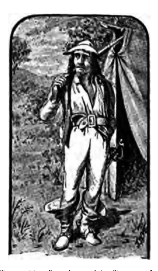
Figure 2. "A Brazilian gypsy" in Wells, Exploring and Travelling , p. 378. The text (pp. 379–384) that this picture illustrates states: "Most of them [ Ciganos ] were really handsome fellows, with dark olive complexions, bright keen black eyes, good features, long glossy black hair hanging in greasy ringlets that reached to their shoulders; some were dressed in tanned deer-skin suits, others in the ordinary coarse cotton costume of the country. All were well armed with long pistols ( garouches ); others also carried carbines, knives, and sabres. [...] [Several] had just arrived from a long journey from São Paulo, where they had been purchasing mules, and were then taking them to Bahia for sale, or any place along the way. [...] The tribe consisted of about fifty men and women, and several children."

Source: James W. Wells, Exploring and Travelling Three Thousand Miles through Brazil from Rio de Janeiro to Maranhão (Philadelphia, PA, 1886).