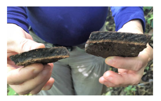
Figure 2. Potsherds found on the surface near the edge of the control site. (Color online)

A forest inventory can reveal the anthropogenic influences on a landscape. In the Amazonian context, a forest inventory involves collecting all species greater than or equal to 10 cm in diameter at 1.3 m up from the ground level (called DBH) and then determining the frequency, density, and dominance of known disturbance indicators (e.g., Anderson and Posey 1989; Balée and Campbell 1990; Peters et al. 1989). The usual size of the forest inventory in Amazonia is 1 ha (ter Steege et al. 2013), although up to 3 ha were sometimes inventoried in the past to show asymptotic species/area curves: the amount of area needed in an alpha-type zone to accommodate the maximum or nearmaximum number of species. It has also been suggested that most diversity can be sampled with highly linear inventories, such as 10 \times 1,000 m or 10 \times 3,000 m (e.g., Campbell et al. 1986).