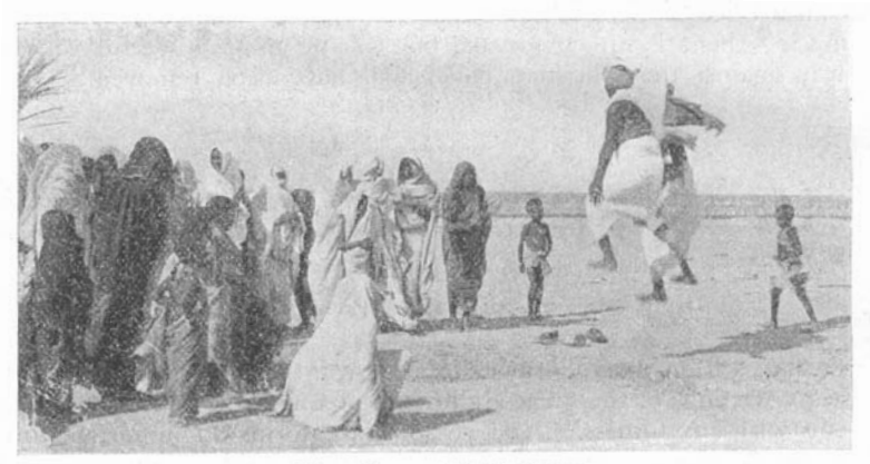
Hamitic wedding dance

Demy 8vo. pp. xvi + 158. With 91 maps and illustrations and 12 diagrams. Price 105. 6d. net.