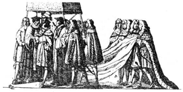
Charles II in his Coronation procession

Large crown 8vo. Volume I, 597—1603. Price 4s. 6d. Volume II, 1603—1815. Price 3s. 6d.