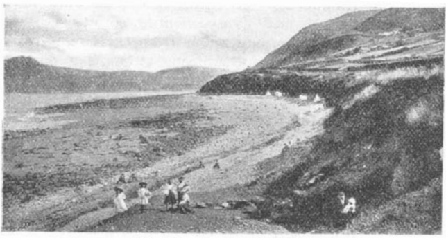
The Beach, Llwyngwril

Crown 8vo. pp. x+166. With maps, diagrams and illustrations. Price 15. 6d.