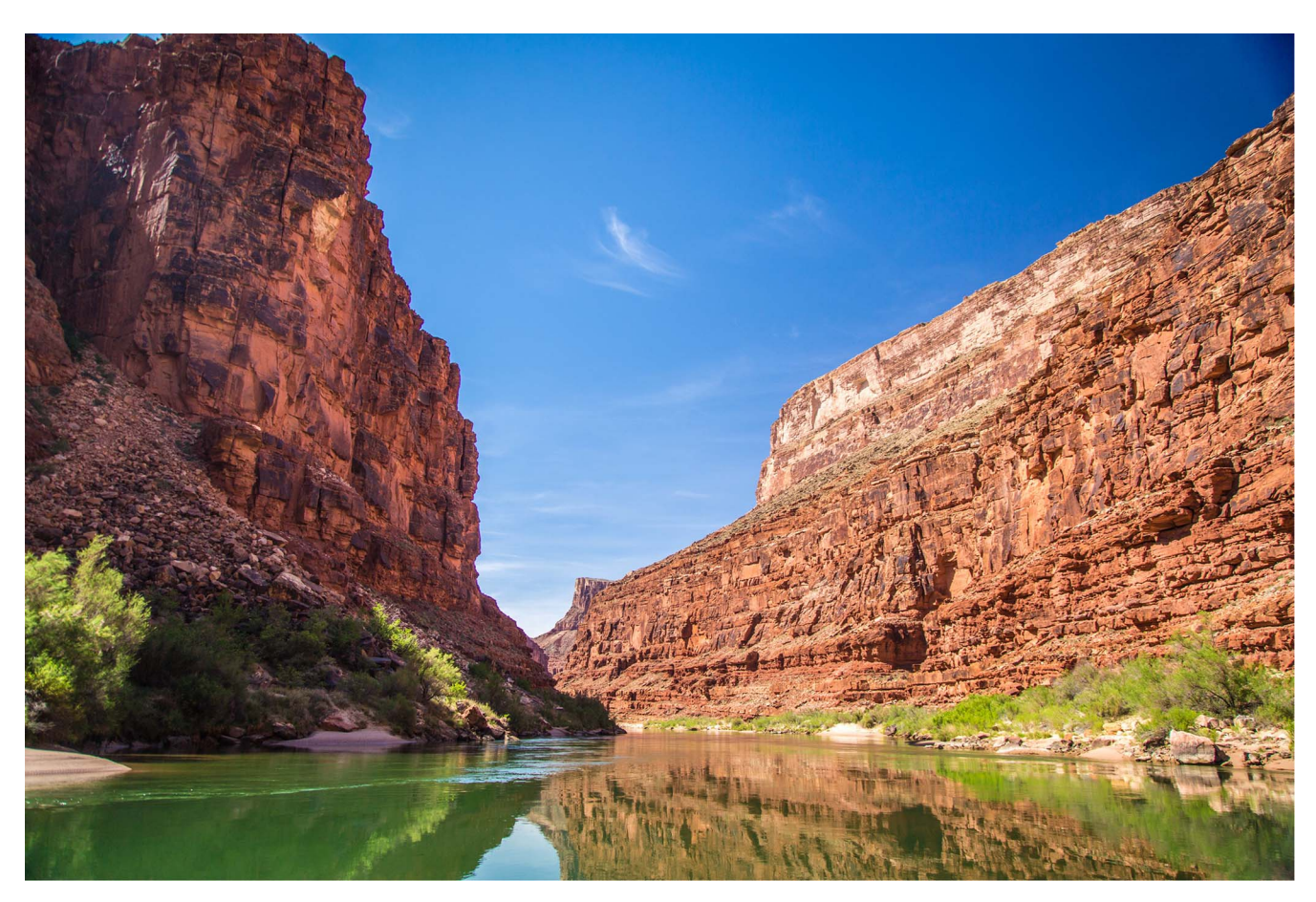
FIGURE 1. Grand Canyon.

Ancestral (archaeological) sites located in the Grand Canyon are interconnected to one another by trails, and these trails connect the sites to the Zuni Pueblo. As such, the sites and trails act collectively as spiritual connections between Zuni ancestors and present-day Zunis, connecting the places that define and maintain the spiritual connection to the Zuni cultural landscape. The Pueblo of Zuni considers all ancestral archaeological sites to have the status of traditional cultural properties (TCPs) because these places are tangible monuments validating Zuni emergence and migrations that play fundamental roles in sustaining Zuni individual and collective cultural identities. Speaking about the importance of these sites in teaching Zuni children about their history, a Zuni cultural advisor, Daniel Bowannie, exclaimed, "Being born at Zuni Pueblo doesn't make you Zuni; it's all these old places. The same blood still runs through our veins. This is where our culture came from" (Dongoske et al. 2019:131).