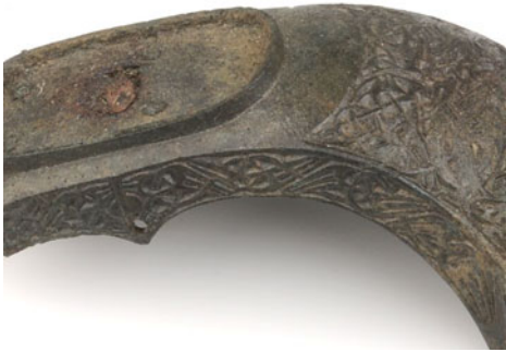
Figure 7. Extended, perforated lobe on bow, Österrekarne, Södermanland, Sweden (SHM 8716).

arrangements. This underlines how the brooches must have mostly been worn horizontally, with the head plate pointing towards the right, as in the gold foil figures and the Aska amulet. This is consistent with the position of brooches in inhumation burials from northern Norway (Glørstad & Røstad, 2015: 195–96). The brooches' perforated bows or plates, together with the large number of beads found in many of these burials, suggest that the brooch and the beads formed a set, and should not be seen as separate categories. This is corroborated by contemporary hoards containing comparable sets of jewellery (Oras et al., 2019: 163–64; see also Røstad, 2018 with references).