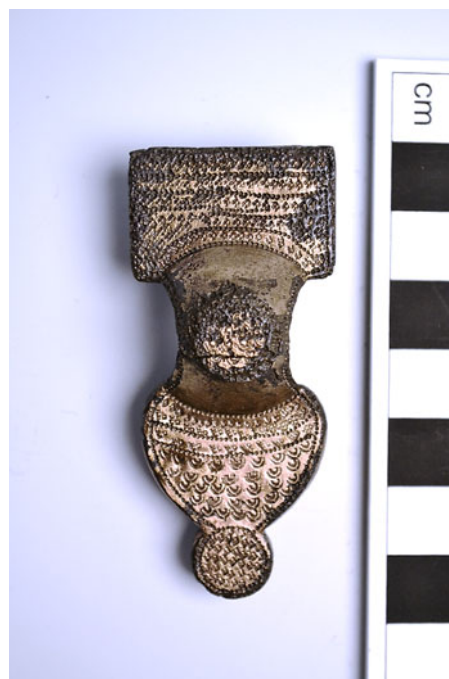
Figure 2. Prototype variant, Lunda, Uppland, Sweden (SHM 32300: A1). Length: 6.5 cm.

Ørsnes’ work has proved particularly influential, and several later studies build on his typology, which rests mainly on the southern Scandinavian and Gotlandic material (Gudesen, 1980; Høiland Nielsen, 1987; Olsen, 2006). Consequently, some characteristics that appear only on brooches from Norway and Sweden do not fit into Ørsnes’ scheme. Several brooches from Norway and mainland Sweden are, for instance, larger than their southern Scandinavian counterparts and include features absent in that material (Gjessing, 1934: 138–39). Ørsnes’ typology stresses one specific element, i.e. the presence of one versus three roundels on the footplate, as an overall principle for the subdivisions. This is a traditional distinction between brooches from Gotland and mainland Scandinavia, but it is not a consistently observed difference (Ørsnes, 1966: 106). Arguably, this characteristic only plays a