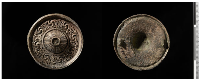
Figure 8. Re-used Insular mount, Skedsmo, Akershus, Norway (C15211). Left: front; right: back.

reliquaries reworked as brooches (Figure 8), may even have alluded to the disc on the bow itself. By including in the women's dress Insular items referring to exclusive objects and fragments, upcoming entrepreneurs and families could create an illusion of old lineages and traditions, which was the traditional means of achieving exclusiveness and influence.