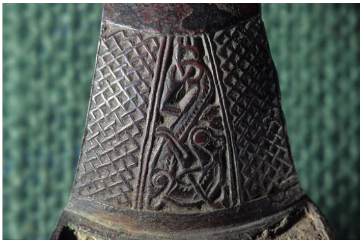
Figure 5. Triangular section on Phase 3 brooch, Tømmerås, Trøndelag, Norway (T1120).

urban networks (Sindbæk, 2012). Part of the brooches' growing significance and prestige may thus be connected to the display of access to the resources needed for their production.