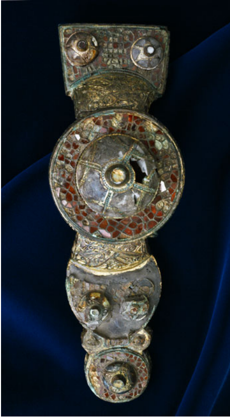
Figure 1. Disc-on-bow brooch, Melhus, Trøndelag, Norway (T6574). Length: 24 cm.

2007; André, 2013) and on interactions with monuments and landscapes (Thäte, 2007; Lund & Arwill-Nordbladh, 2016). There has, however, been little attempt to explore this period by combining knowledge gained from typology and detailed contextual studies with theoretical consideration of socially-constituted temporalities and identities (see Fowler, 2017).