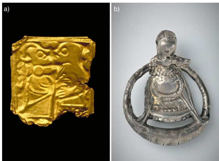
Figure 6. Depictions of idealized women, with detailed renderings of disc-on-bow brooches included in the women's appearance. a) gold foil from Ekerö/Helgö, Uppland, Sweden (SHM 25075/ 1101); b) silver amulet, Aska, Hagebyhöga, Östergötland, Sweden (SHM 16429/1).

meaning is unknown; but their context suggests that they were associated with centres fulfilling political, economic, and cultic functions controlled by the elite (Watt, 2004; Ratke & Simek, 2006). Despite their minute size, the gold foils show a remarkable level of detail in the depiction of bodies, clothes, and key accessories associated with highly ritualized roles or ritual transformations (Back-Danielsson, 2002; Hedeager, 2015). Several gold foils show women wearing a disc-on-bow brooch placed horizontally, with the head plate pointing toward the woman's right, just under the woman's chin (Figure 6a). A disc-on-bow brooch is also clearly depicted and placed in the same manner on a silver amulet from Aska, Sweden, dating to c. AD 800 (Figure 6b) (Arwill-Nordbladh, 2007). In these depictions, the disc-on-bow brooch emphasizes what appears to be complex symbolic images; it has been suggested that the brooches represent the mythical necklace 'Brisingamen' of the goddess