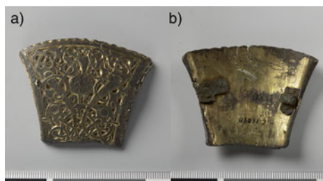
Figure 4. Bow fragment with worked edges, Melø, Vestfold, Norway (C11898). a) front; b) back with secondary pin/catchplate.

The quantity of fragmented brooches increases throughout the period under scrutiny, while the number of complete brooches decreases. The extent of deliberate vs accidental fragmentation is difficult to estimate, although clearly many fragments are the result of the deliberate and targeted breaking up of brooches. In Phases 2 and 3, this seems to target particularly two elements: the bow and the discs and crowns. The increased use of