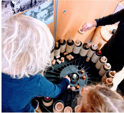
Figure 1. Aesthetic explorations with cork, image provided with permission, Anna-Helen Kaupang-Schøning.