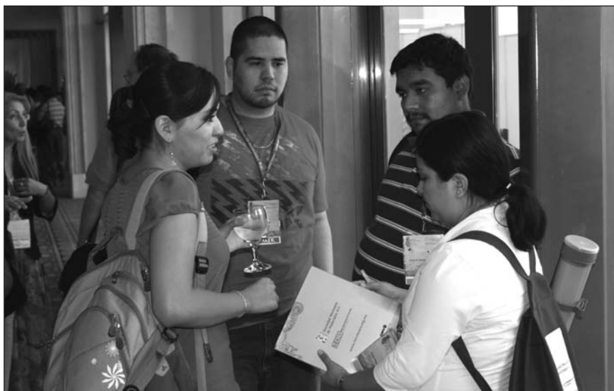
Meeting attendees converse during breaks between technical sessions.

The Water Forum was developed to help define the major materials issues facing emerging water supply, treatment, and purification practices in both developed and developing regions of the world, but with an emphasis on Mexico. S.E. Garrido Hoyos of the Instituto Mexicano de Tecnología del Agua said that significant problems in Mexican water resources are water quality and the inability to harvest a greater percentage of its precipitation and distribute it as drinking water. The removal of arsenic from Mexican drinking water is a top concern. The technologies currently used to remove arsenic have the drawback of generating arsenic waste sludge. Newer, more promising treatments include capacitive deionization, sand filtration, and absorption of arsenic onto goethite. In a separate presentation, B. Marinas of the University of Illinois, Urbana-Champaign, USA, addressed research being conducted to disinfect drinking water from viral pathogens.