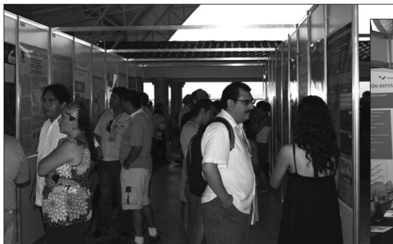
(Above) The evening poster sessions generate much enthusiasm.