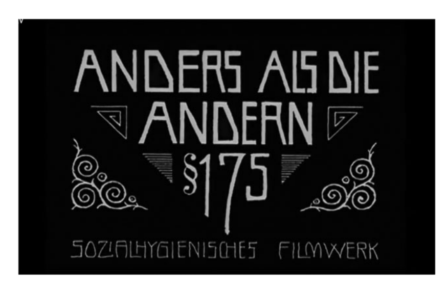
Filmmuseum München initial title card

the film within its revolutionary context. It presents the audience with a "brochure" to read, historicizing the experience.