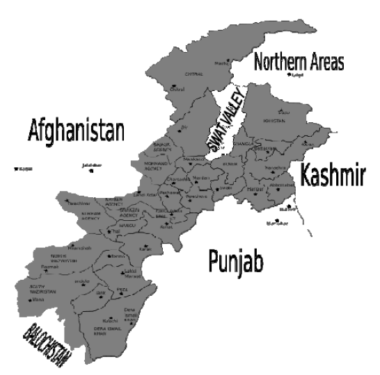
Figure 1 Map of Swat Valley sampling site

Samples from the Bir-Kot-Ghwandai excavation (Swat Valley, 36°33′N, 74°02′E) (Figure 1) in Pakistan were collected in 1987–1990 and submitted from 1988 to 1991 by P Callieri, Department of Archaeology, University of Bologna, Italy.