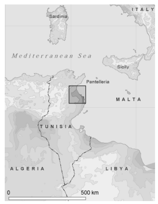
Figure 3 Map of the Tunisian sampling area

The shell samples came from the SHM-1 excavation, 5 km south of the village Hergla in the coastal lagoon Sebkhet Halk el Menzel (Sousse region, 36^{\circ}00'61''N ; 10^{\circ}27'49''E ; see Figure 3). They were collected and submitted in 2002 and 2007 by S Mulazzani, Department of Archaeology, University of Bologna, Italy. Ages were calibrated using the marine curve Marine04 (Hughen et al. 2004), applying a reservoir effect correction ( \Delta R ) of 58 \pm 85 yr (Reimer et al. 2002).