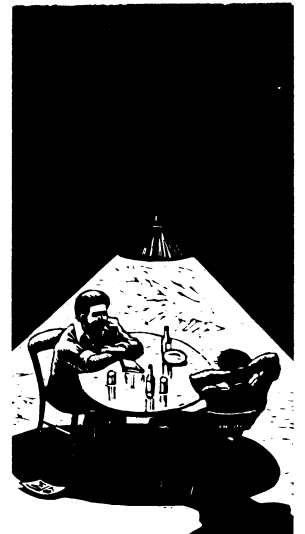
Illustration from MEMOIRS OF A MEXICAN POLITICIAN