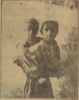
Cette jeune femme, en robe de chambre, est une des femmes de couleur qui ont fait la fortune de la beauté Margaïne.

Ces six années, après, ont semblé telles à un immense nid de Pigeons, en son intérieur dans ce qui paraît être un simple appartement de la rue de Valenciennes.