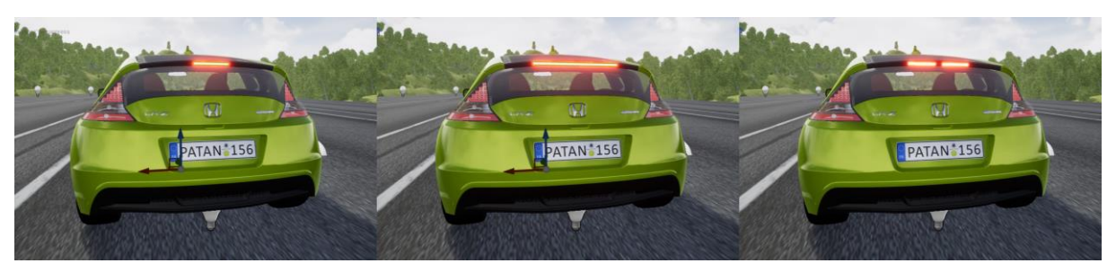
Figure 2 – Different iterations of the design of a break light above the trunk door

a rectangle that had an emissive material applied to it. Three different configurations from the development process are shown in Figure 2 below.