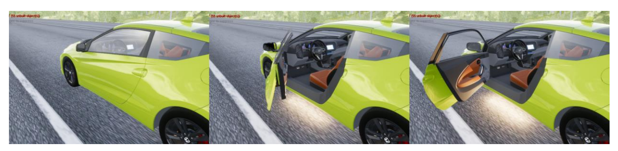
Figure 3 – Image sequence showing the spotlight under the driver door. The spotlight is turned on when the player moves close to the door.

To further enhance the experience, two interactive scenarios were created. In the first scenario, a spotlight below the trunk door lit up when the player approached the vehicle from behind. This was achieved by using a box trigger, an object that activates a behaviour when it is interacted with by the player. In the second scenario, a spotlight switched on below the driver door as the door was opened. This is shown in Figure 3 below.