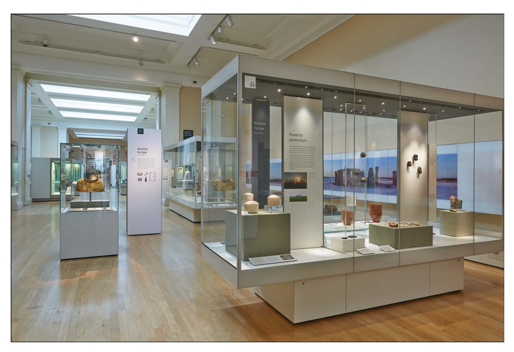
Figure 2. Neolithic and Bronze Age objects on display in Gallery 51 at the British Museum today (photograph © The Trustees of the British Museum. Shared under a Creative Commons Attribution-NonCommercial-ShareAlike 4.0 International (CC BY-NC-SA 4.0) licence).

The resulting icon-oriented approach to display has had significant curatorial consequences. Firstly, while single objects can have many layers of meaning (Cooper et al. 2021: 135–43), they are more limited in what they can convey about complex processes (e.g. an axe displayed simply as a token of lifestyle or identity, rather than as one object of