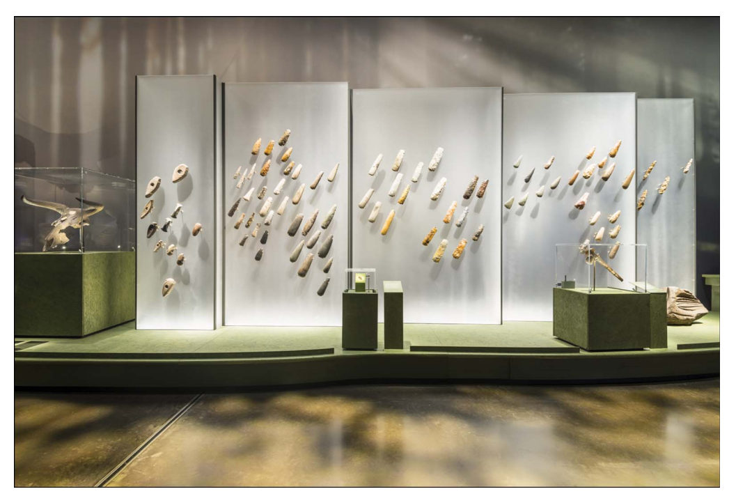
Figure 5. The 'axe wall' in the WoS exhibition (photograph © The Trustees of the British Museum. Shared under a Creative Commons Attribution-NonCommercial-ShareAlike 4.0 International (CC BY-NC-SA 4.0) licence).

Although the exhibition narrative of WoS was framed around the rise and fall of Stonehenge, with key objects from the monument and its landscape woven throughout, it also sought to subvert the monument's iconic status by highlighting other, less famous, contemporary sites. The Early Bronze Age timber monument known as 'Seahenge' (Holme-next-the-Sea, Norfolk) was discovered in 1998 (Brennand et al. 2003) (Figure 6).