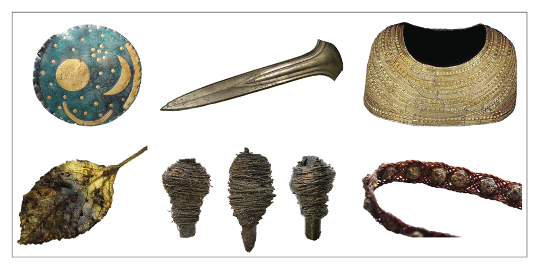
Figure 4. Icons (top row) and alternative icons (bottom row) in the WoS exhibition: Nebra Sky Disc; Oxborough dirk; Mold Gold Cape; Windy Harbour leaf; Must Farm thread on dowels; White Horse Hill cattle hair bracelet with tin studs (note: objects are not to scale) (photographs by State Office for Heritage Management and Archaeology, Saxony-Anhalt/Juraj Lipták; Trustees of the British Museum (CC BY-NC-SA 4.0); Oxford Archaeology; Cambridge Archaeological Unit; Plymouth Museum).

The first landscape zone (Forest, entitled 'Working with Nature') explored the transformations of the British landscape from the start of the Neolithic. A 6000-year-old elm leaf from recent excavations by Oxford Archaeology at Windy Harbour, Lancashire, was presented as an emblem for the fragility of the natural world. Strictly an ecofact (one of many recovered