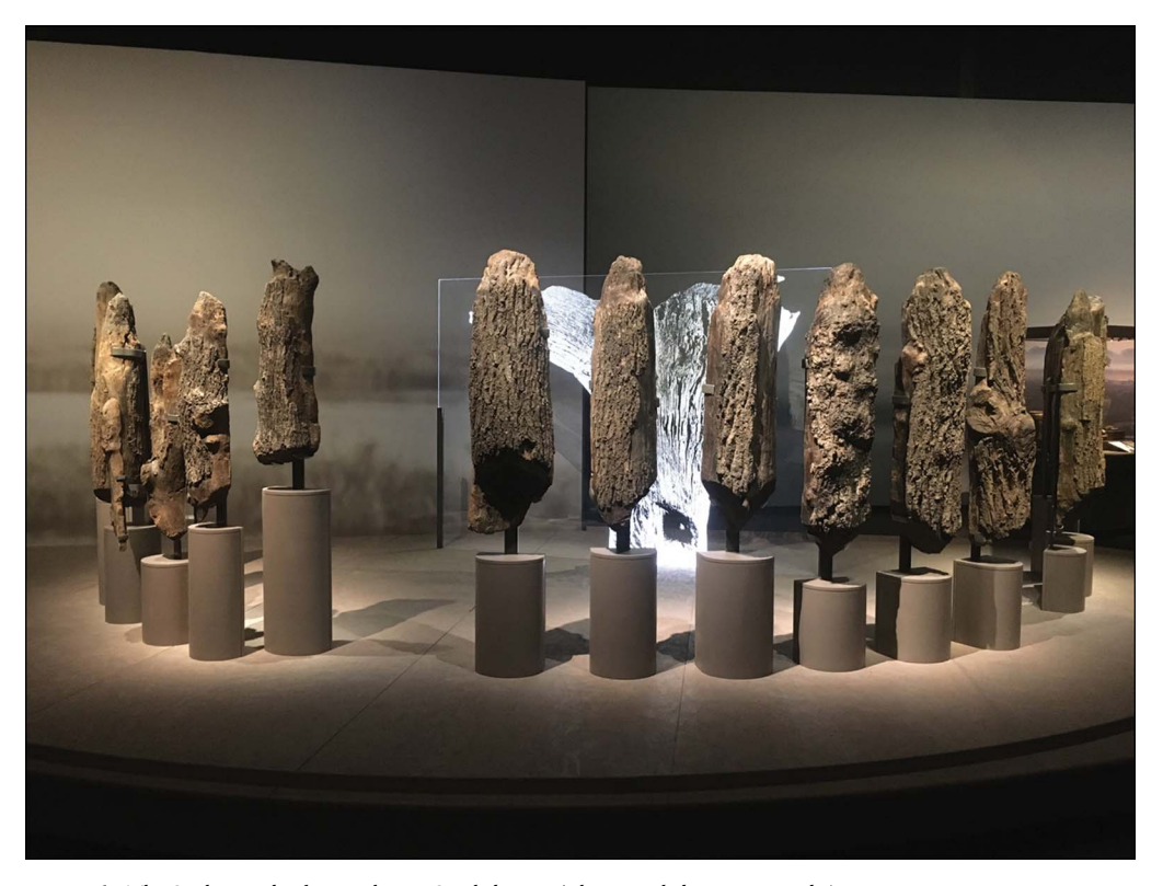
Figure 6. The Seahenge display in the WoS exhibition.

From these reactions we surmise that successful alternative icons are about more than changing approaches to the selection and written interpretation of objects. To offer alternative