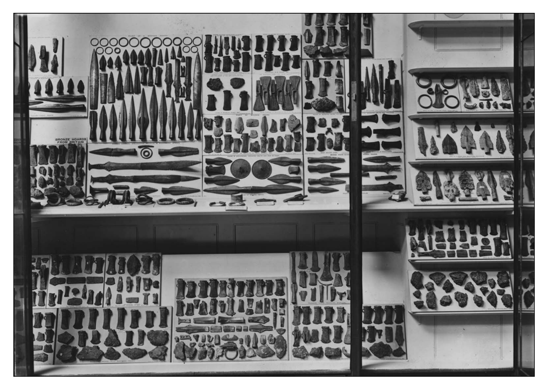
Figure 1. Later prehistoric objects on display in the British Museum in the early twentieth century (photograph © The Trustees of the British Museum. Shared under a Creative Commons Attribution-NonCommercial-ShareAlike 4.0 International (CC BY-NC-SA 4.0) licence).

Recent research on the history of acquisition at the British Museum has shown that finds from archaeological excavations in Britain (primarily England) represent around one-third of the entire collections database, approximately 1.5 million objects (MacDonald 2022: 5). The vast majority of these were excavated and acquired between the 1960s and 1990s, a time of expanding awareness of the analytical and scientific potential of the archaeological record linked to the rise of 'new archaeology' (Clarke 1973). Before this, the retention and preservation of archaeological material was far less complete. Most European national museums contain a nucleus of prehistoric objects gathered by nineteenth- and early-twentieth-century antiquarians, archaeologists, collectors and curators (Amkreutz 2020). These collections are typically composed of relatively small, visually striking and durable artefacts perceived to have strong cultural, social or ethnic signification during prehistory. Somewhat paradoxically, between the mid-nineteenth and mid-twentieth centuries there was a policy of near total display of those objects which were in collections in most UK museums (Figure 1). In contrast, from the 1970s onwards there was a process of 'iconification' as the most remarkable and extraordinary objects were asked to stand for whole periods and geographies (Figure 2)—an approach that