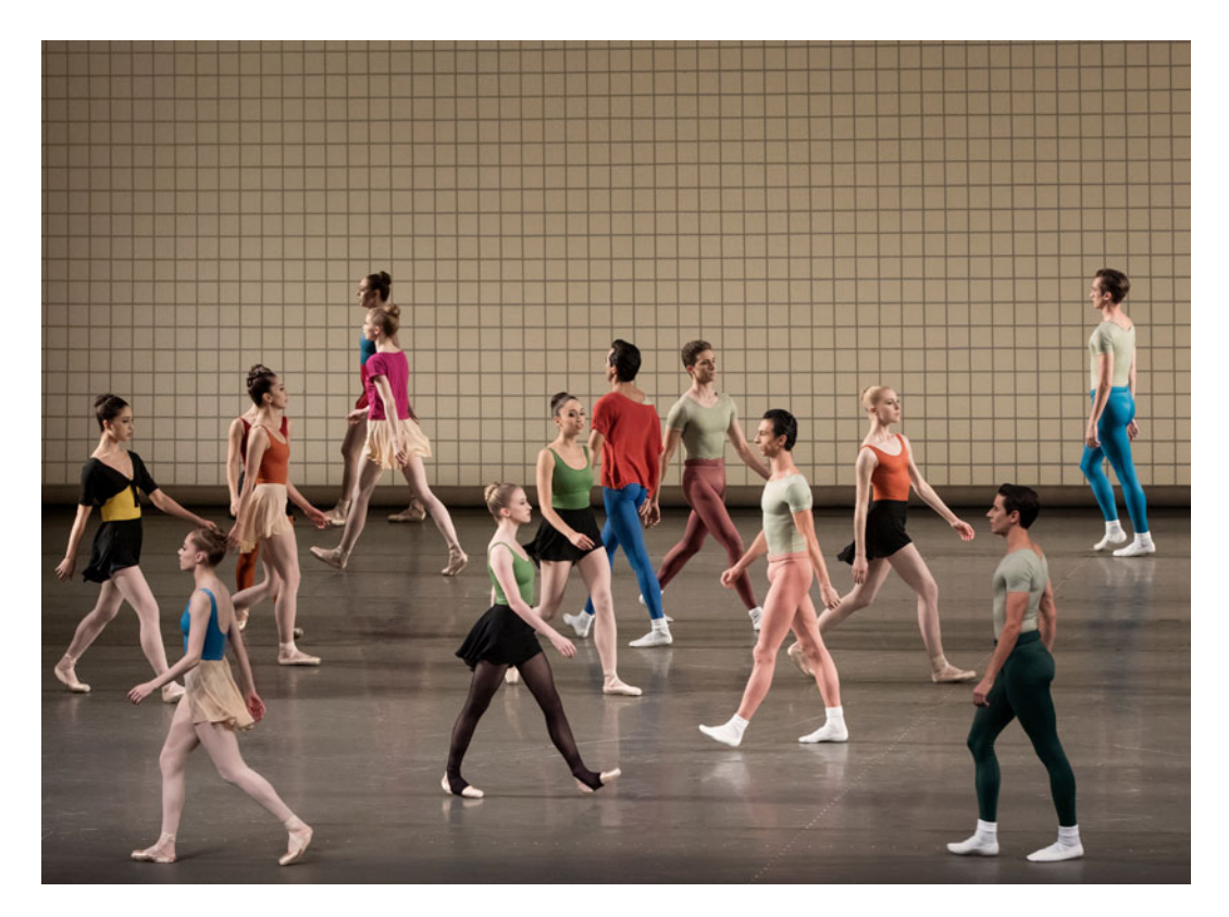
Figure 1. NYCB dancers in the opening section of Glass Pieces.

walk haphazardly across the stage. They are dressed in costumes designed by Ben Benson to evoke a combination of practice outfits and low-key streetwear (Figure 1).<sup>35</sup> The corps follow Rainer's plan, rejecting a hierarchical relationship of parts, phrasing, and development, and substituting everyday movement, neutral performance, equality of parts, and uninterrupted movement. They interact very little with the Glass score, and not at all with its pulse. Robbins instructed the dancers to look like commuters in Grand Central Station at rush hour.<sup>36</sup> In my interviews with the original cast, a number of dancers agreed that the experience onstage mimicked the experience of living in New York. In original cast member Jock Soto's words, "It's Times Square, it's the subway, people flying... and all the three thousand people that come to the theater, they're doing the same thing, walking quickly to get to a