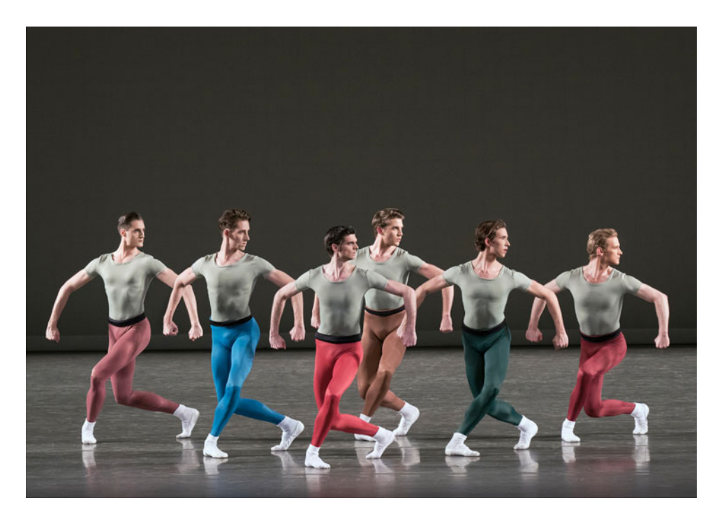
Figure 4. Unusual reference to Egyptian artistic figures in ballet. Note the head tilt to the side, with the torso facing the audience. NYCB dancers in Glass Pieces , section three.

in the second movement. The corps seemed to have appreciated it, particularly the men in the corps, who at NYCB often get much less active dancing than the women.<sup>61</sup>