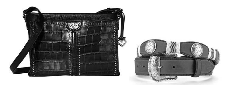
FIGURE 25.4 Brighton handbag and belt by Leegin.

Respondent, PSKS, Inc. (PSKS), operates Kay's Kloset, a women's apparel store in Lewisville, Texas. Kay's Kloset buys from about 75 different manufacturers and at one time sold the Brighton brand. It first started purchasing Brighton goods from Leegin in 1995. Once it began selling the brand, the store promoted Brighton. For example, it ran Brighton advertisements and had Brighton days in the store. Kay's Kloset became the destination