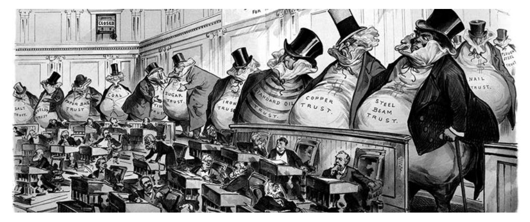
FIGURE 25.1 The Sherman Act was enacted to combat the worst abuses of sprawling business "trusts."

On the other hand, IP rights, by their very nature, afford their owners exclusive rights over certain works and inventions. They are sometimes referred to as legally sanctioned monopolies. Intellectual property licenses are arrangements among multiple parties. It should thus be obvious that IP licensing intersects with, and can run afoul of, the antitrust laws in a variety of ways.