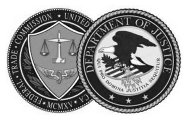
FIGURE 25.2 Unlike most countries, the United States has two antitrust enforcement agencies with overlapping jurisdiction and sometimes conflicting policies.