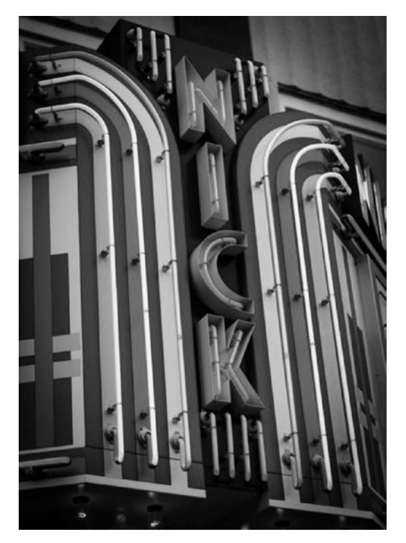
FIGURE 25.8 The Nickelodeon Theater in Santa Cruz, Cal.

The Supreme Court has emphasized, however, that the Sherman Act does not restrict "the long recognized right of a trader ... engaged in an entirely private business, freely to exercise his own independent discretion as to the parties with whom he will deal." United States v. Colgate Co. , 250 U.S. 300, 307 (1919). Because of a supplier's right to choose his customers and set his own terms, antitrust plaintiffs are required to do more than merely allege conspiracy and unequal treatment in order to take a case to trial. According to the law of this circuit, once a defendant rebuts the allegations of conspiracy with "probative evidence supporting an alternative interpretation of a defendant's conduct," the plaintiff must come forward with specific factual support of its conspiracy allegations to avoid summary judgment.