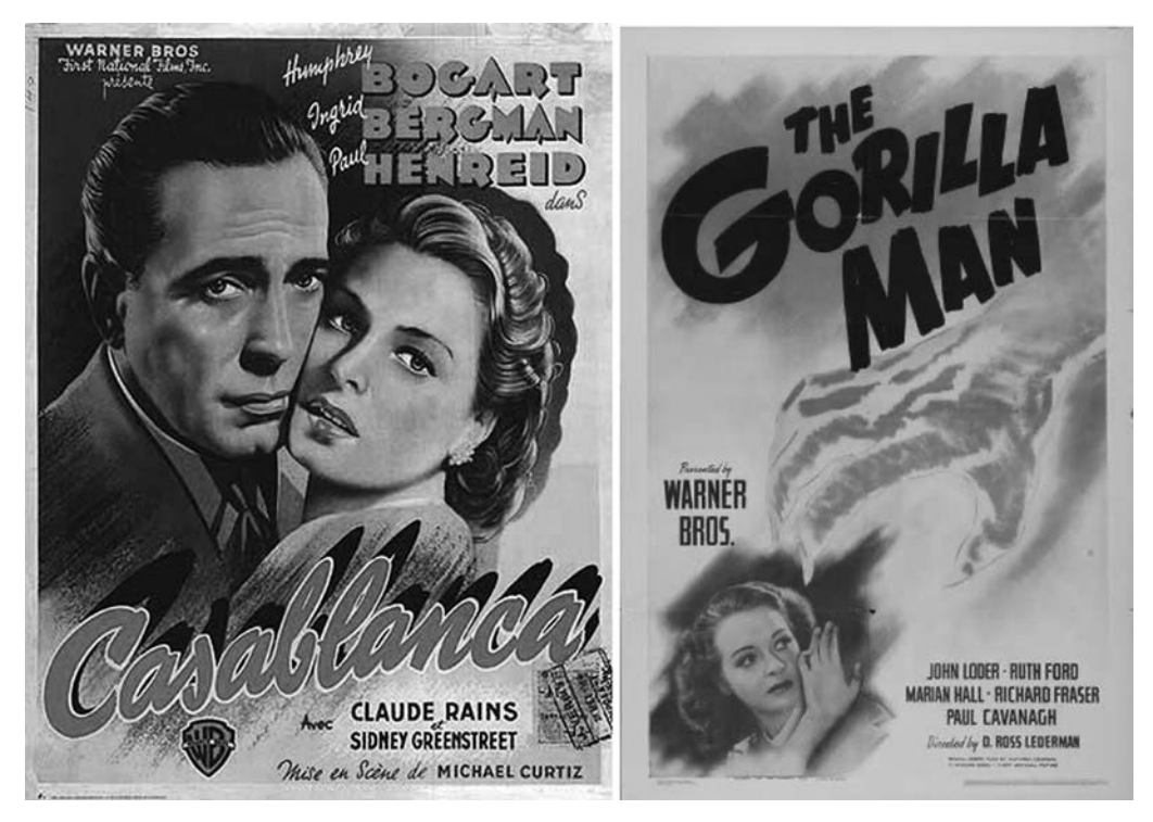
FIGURE 25.5 With "block booking," in order to show classic films like Casablanca , television stations and movie theaters were also required to license, and pay for, "B" movies like The Gorilla Man .

because of the pervasively innovative character of platform software markets, tying in such markets may produce efficiencies that courts have not previously encountered and thus the Supreme Court had not factored into the per se rule as originally conceived.