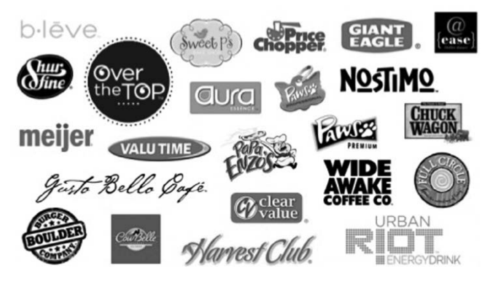
FIGURE 25.3 Some of the brands developed by Topco.

Following approval, each new member signs an agreement with Topco designating the territory in which that member may sell Topco-brand products. No member may sell these products outside the territory in which it is licensed. Most licenses are exclusive, and even those denominated "coextensive" or "non-exclusive" prove to be de facto exclusive.