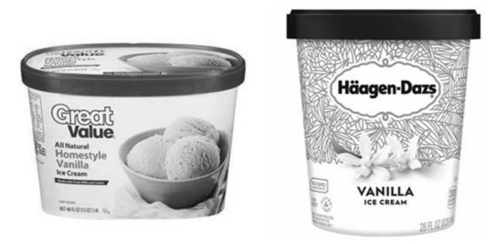
FIGURE 25.6 Häagen-Dazs successfully argued that inexpensive and expensive ice cream products compete in the same market.

Market power is always defined by reference to a particular market . In antitrust cases, two types of market are generally considered: product and geographic markets. Entire books have been written about the complex exercise of defining markets in antitrust cases.<sup>29</sup> Geographic markets are defined based on the ability of suppliers to sell beyond their immediate locations, taking into account factors such as transportation costs, buyer convenience and customer preferences. To grossly oversimplify, the principal factors that are evaluated when defining a product market include the degree to which different products can function as substitutes for one another, the degree of price elasticity among different products and the degree to which producers can easily shift from production of one product to another. Thus, in one well-known case involving an exclusive distribution arrangement among Häagen-Dazs and its distributors, potential markets could have included the market for all frozen desserts, packaged ice cream, packaged premium ice cream.<sup>30</sup>