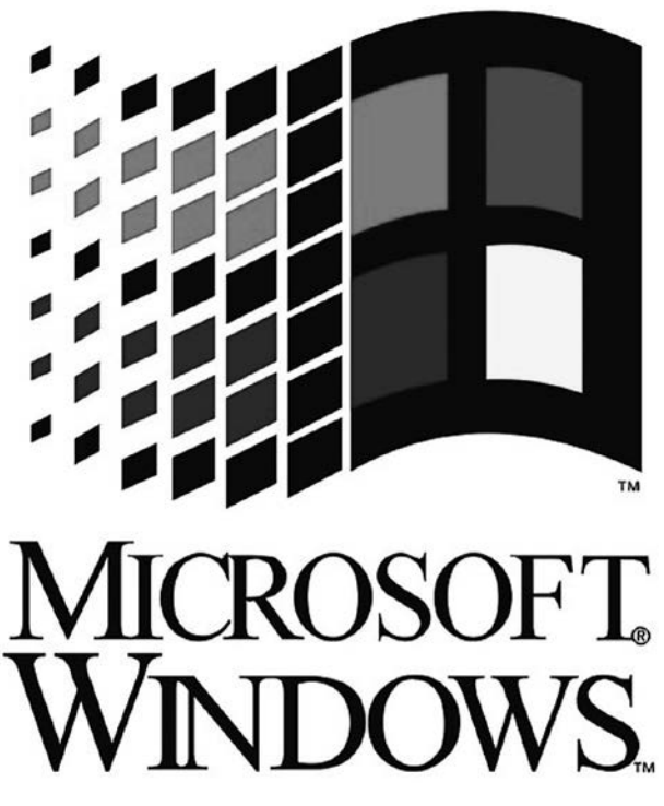
FIGURE 25.7 Microsoft's Windows operating system captured 95 percent of the relevant operating system market.

(1) most consumers prefer operating systems for which a large number of applications have already been written; and (2) most developers prefer to write for operating systems that already have a substantial consumer base. This "chicken-and-egg" situation ensures that applications