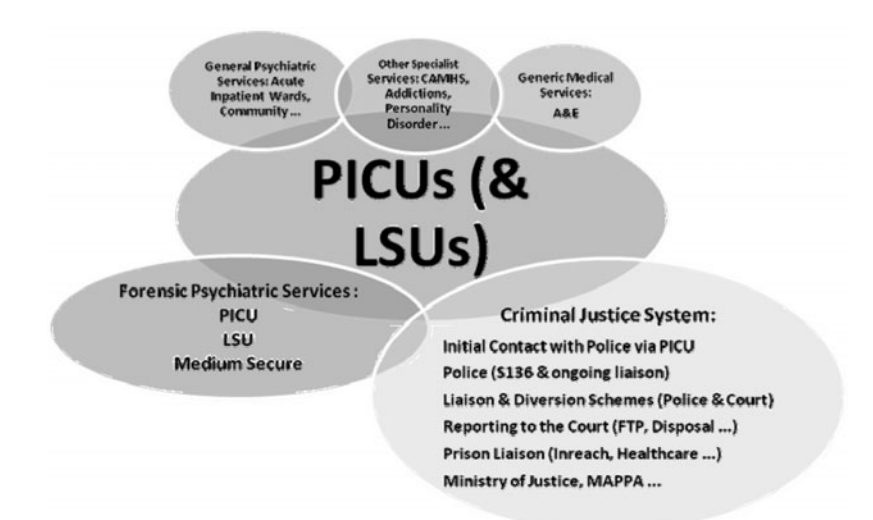
Figure 1. The interfaces of the PICU

PICU patients have some criminal history; the number can be as high as 59% (Eaton & Ghannon, 2000) with the majority having committed violent offences. Once on the PICU, patients are three times more likely to be violent than their counterparts on the acute general adult psychiatry ward (Brown & Bass, 2004) opening up avenues for further liaison with the criminal justice system.