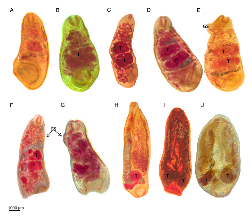
Fig. 3. Sections of adult paramphistomoids collected from domestic ruminants in Kenya and their provisional identifications. (A) Calicophoron phillerouxi, (B) Calicophoron raja, (C) Calicophoron clavula, (D) Calicophoron microbothrium, (E) Cotylophoron sp., (F) Cotylophoron cotylophorum, (G) Cotylophoron sp., (H) Carmyerius exporous, (I) Carmyerius gregarius, (J) Carmyerius mancupatus. Note that the photographed specimens represent sections of adults, and presence of some organs like the testes (T) or genital sucker (GS) are indicated. For the genus Carmyerius, a ventral pouch was present, but is not visible in the sections chosen for presentation.

marks in Fig. 1 were assigned based on our morphological identification from species descriptions.