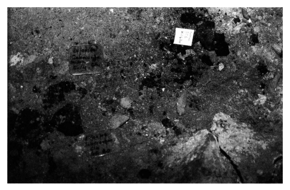
Figure 1 Photograph from the cave floor in the Megaceros gallery showing two of the sampled charcoal pieces

precombustion at 330 °C, or 630 °C in the case of sample GC40. The alkaline fractions resulting from the pretreatment of GC41 and GC42 were also dated by the Groningen laboratory. Thus far, 29 dates have been obtained: 10 each on GC40 and GC41 and 9 for GC42. The ages and key data for the dating process (such as background values, \delta^{13} C values, and <sup>14</sup>C activities [in pMC] of the samples) are reported in Table 1. The <sup>14</sup>C activities are also plotted in Figure 2.