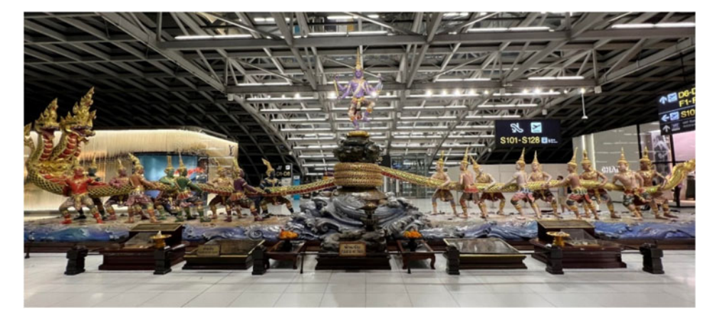
Figure 3. The art of Kuan Kasian Samut at Suvarnabhumi Airport, Thailand.

challenges the perception of the Asun race from the perspective of a mixed-race heroine, starting with the statement that "she is like most people who admire Thep. It is caused by the traditional belief that an individual will be reborn in heaven or Himmaphan as it is a given that Thep are good people, whereas