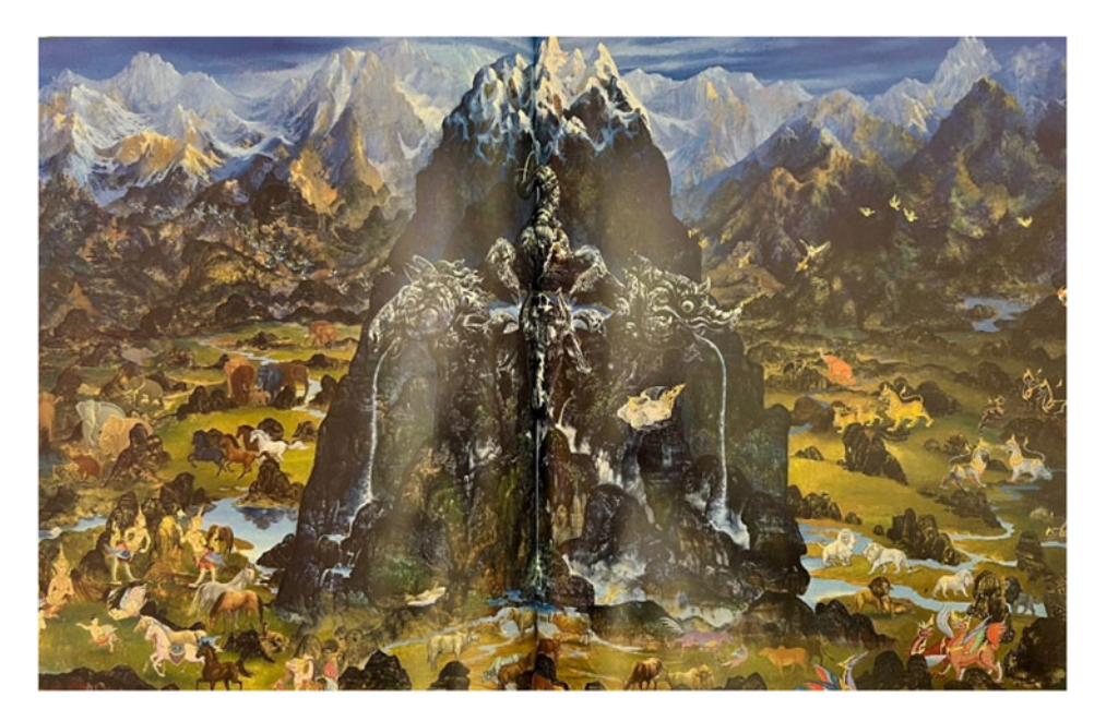
Figure 2. Illustration of Himmphan in contemporary art.