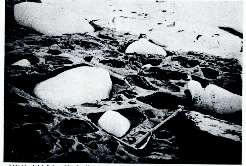
Fig. 1. "Mini-kettle-holes" formed by the ablation of ice stranded on the basin floor of Tulsequah Lake 3 days after it had drained.

Dr J. K. Maizels' (1977) paper on laboratory simulations of kettle-hole development was a reminder of "mini-kettle-hole" formation observed in July 1958. Figure 1 shows the small cavities in various stages of development, each related to the melting rate of partially buried ice blocks.