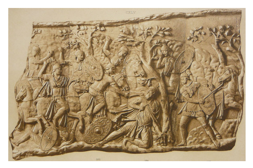
Fig. 4. Scene CXLV. The trees are identified as C.11, E.22 (under which can be seen Decebalus), C.13 and E.23.

and Frere (1988: 177), identified the two figures. Here, the tree acts as an internal scene divider, providing compositional emphasis, similarly to the way that the rich drapes that surround Jupiter Tonans do in scene XXIV.