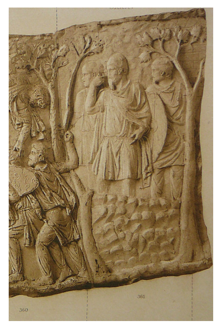
Fig. 5. Scene CXXXV. The trees are identified as E.26 and D.16.

single straight trunk, allows for the scene to be contained both at its edges and at the top of the scene. By containing Decebalus here with a background tree, as opposed to the foreground tree which isolates him from his troops in scene CXLV, the relief identifies him within the scene. This is directly comparable to Trajan's appearance in scene XXXVI, in which two background trees frame him as the key figure of the scene. Decebalus' appearance in the forest is similar to Trajan's appearances elsewhere on the relief, since this is the only scene in which a figure other than the emperor appears in an adlocutio stance. This is one of the most flattering depictions of Decebalus on the relief, since he begins to conform to the expected role of a statesman on the column, which is typified