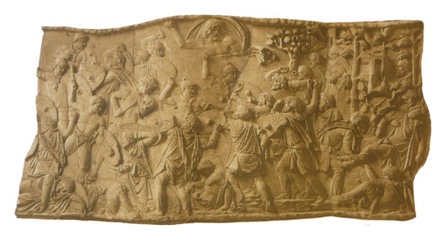
Fig. 3. Scene XXIV. Decebalus' head can be seen in the trees on the right, while Jupiter Tonans aims to hurl his thunderbolt from the left. The trees are identified as a D.18, A.5, A.5, D.16 (underneath the window) and a final A.5.

combining it with the direction of his throwing arm, we find that he appears to be aiming at the Dacian king (Settis et al. 1988: 146). Lepper and Frere (1988: 68) wondered whether this was the sole purpose of the deity's inclusion in the relief, or whether it was instead to indicate the thrust of the Roman forces, who advance into the forest under divine direction, or whether Jupiter Tonans' function is perhaps to indicate that the battle occurred during a thunderstorm (as Cichorius had earlier suggested), and to further imply the 'general support of Olympus' for the Roman cause. The ultimate conclusion, of course, is that the figure of Jupiter Tonans can have all the above functions, but the most obvious one to a viewer is the literal interpretation, that the god is aiming his wrath at the hiding Decebalus.