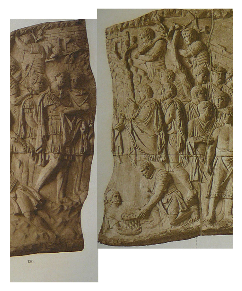
Fig. 7. Scene LII, showing Trajan greeting a Dacian embassy. The trees are both identified as E.22.

embassy, which emerges from the trees of a forest that is being cut down and tamed by the Romans (scene LII: Fig. 7). The final appearance of Trajan in the context of a forest is in scene LXVIII, in which a prisoner is brought in front of the emperor, again from the forest. Each of these scenes is one of two sides, of presentation to Trajan, either the scouts presenting a report of the Dacian territory to Trajan (scenes XXXVI–XXXVII), or the prisoner being presented in scene LXVIII. In these scenes, the trees additionally function in a framing