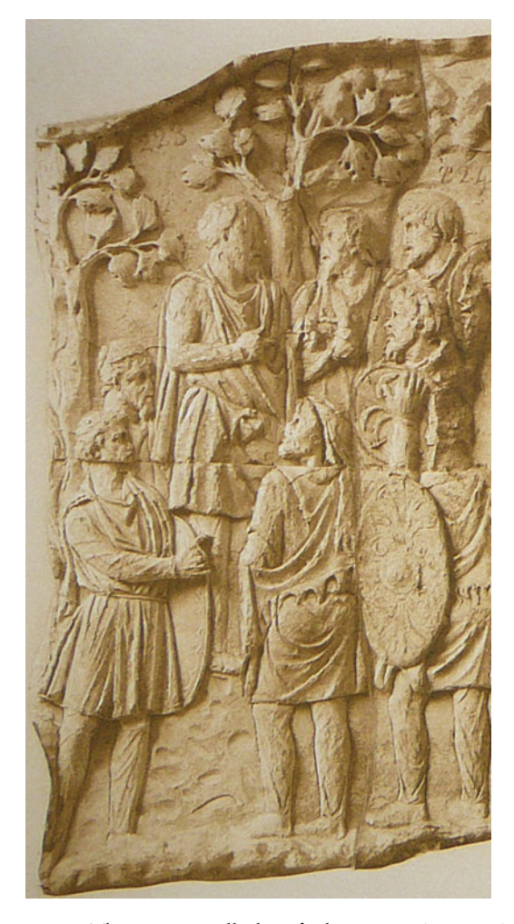
Fig. 6. Scene CXXXIX. The trees are all identified as D.21.

by Trajan's behaviour. As a result, the sculptor here is highlighting rather than isolating the figure of Decebalus, bringing him to the fore in a defining moment of the war, as the Dacian king organizes a retreat. It is not necessarily a good moment for the king to be highlighted, and all the elements of the Dacian defeat come to the fore in this scene: their king, in their native forest, orders their flight, abandoning their country to the advancing Romans, including the trees which will later separate the king from his men (scene CXLV).