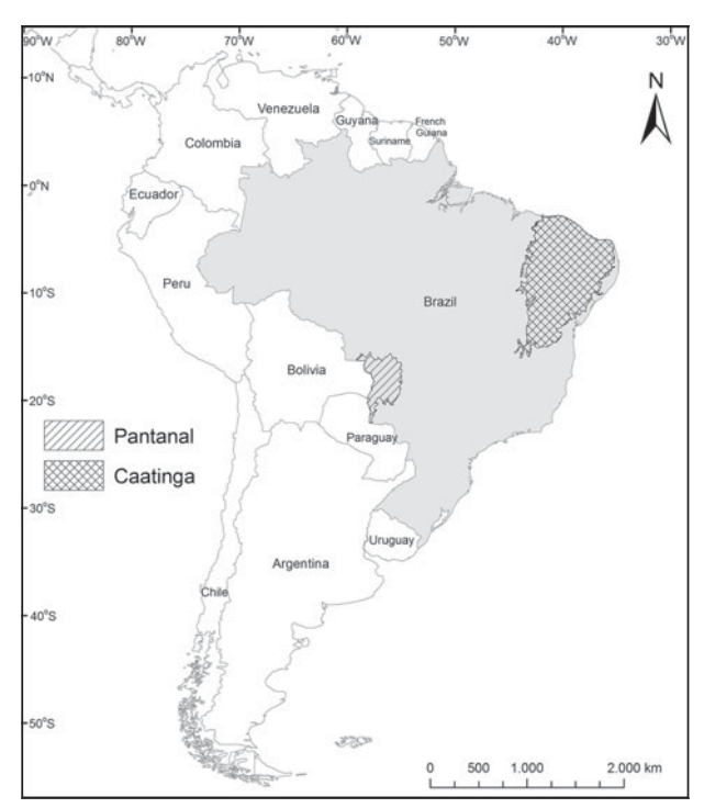
Fig. 1 Locations of the Pantanal and Caatinga biomes in Brazil.

To extract DNA from blood samples we followed standard phenol-chloroform extraction protocols (Sambrook et al., 1989). To extract DNA from faecal samples we used protocols based on the GuSCN/silica method (Boom et al., 1990; Höss & Pääbo, 1993; Frantz et al., 2003). We purified and concentrated the extracted DNA by ultrafiltration, using a Microcon-30 device (Millipore Corporation, Billerica, USA). To monitor for contamination each set of 16 faecal samples included an extraction control. All steps