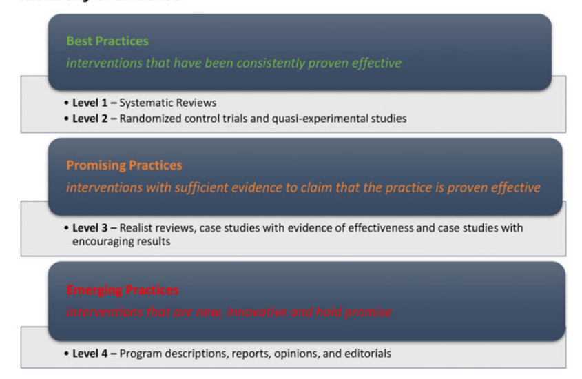
Figure 1. Canadian hierarchy of promising practices evidence (Canadian Homelessness Research Network, 2013)